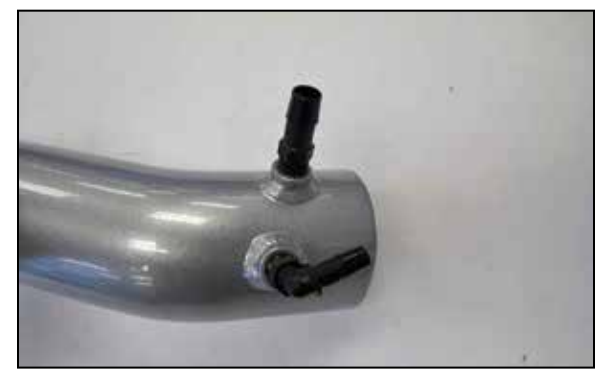
12. Install the provided vent fittings into the K&N<sup>®</sup> intake tube as shown.

NOTE: Plastic NPT fittings are easy to cross thread. Install the vent fitting "hand" tight, then turn it two complete turns with a wrench.