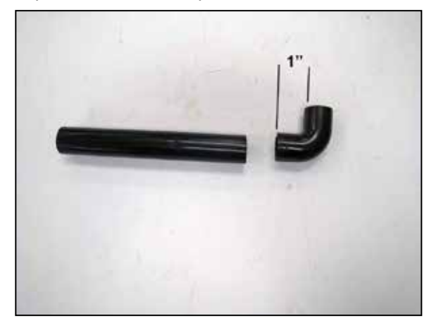
9. Cut the provided BOV hose 1" from the elbow as shown.