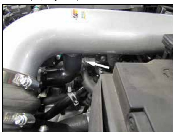
15. Connect the BOV elbow to the K&N<sup>®</sup> intake tube as shown.

14. Connect the factory vent lines to the fittings installed into the K&N<sup>®</sup> intake tube and secure with the factory spring clamps.