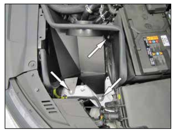
7. Install the heat shield into the vehicle and secure with the provided hardware.