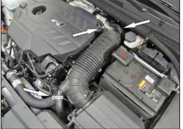
2. Release the spring clamps that secure the breather hoses and BOV hose and then disconnect them from the factory intake tube.

factory intake tube and then remove the intake tube from the vehicle.