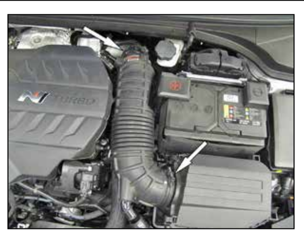
3. Loosen the two hose clamps that secure the