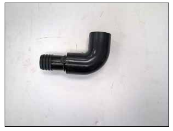
10. Install the provided union fitting into the elbow as shown.