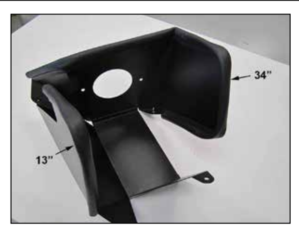
5. Cut the provided edge trim into sections of 13"