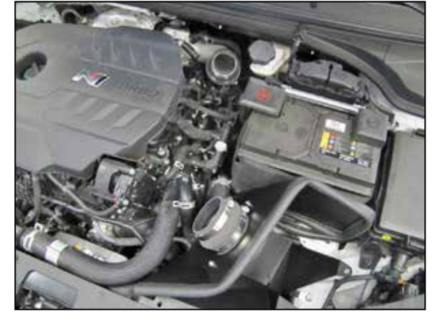
8. Install the provided couplers onto the Turbo inlet (08713) and filter adapter (084079) and secure with the provided hose clamps.