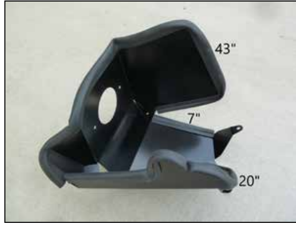
9. Cut the provided edge trim into lengths of 7", 20" and 43" and install them onto the heat shield as shown.