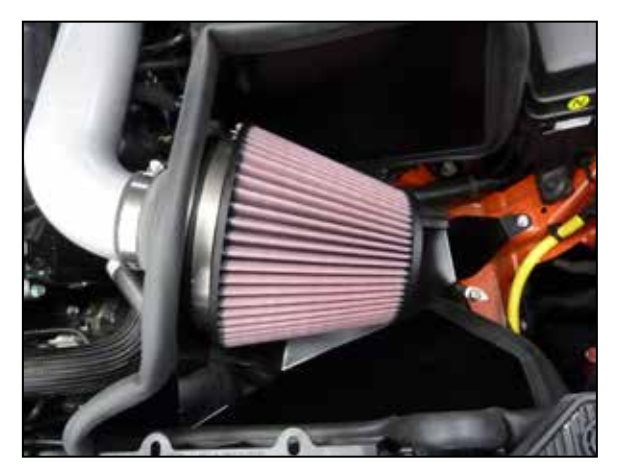
20. Install the K&N air filter onto the filter adapter and secure with the provided hose clamp.