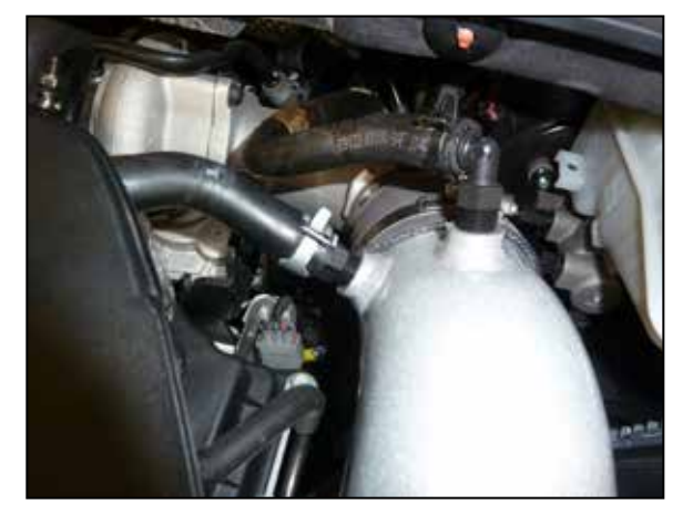
18. Connect the EVAP and CCV hoses to the fitting installed into the intake tube and secure with the factory spring clamps.