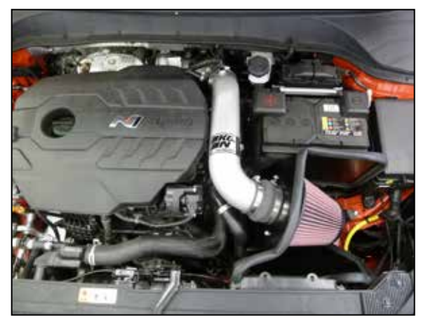
22. Reconnect the vehicle's negative battery cable. Double check to make sure everything is tight and properly positioned before starting the vehicle.

23. It will be necessary for all K&N<sup>®</sup> high flow intake systems to be checked periodically for realignment, clearance and tightening of all connections. Failure to follow the above instructions or proper maintenance may void warranty.