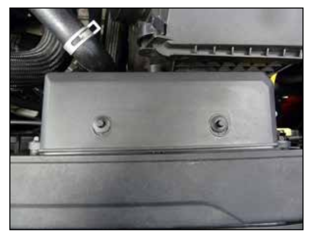
6. Release the centers of the retaining pins that secure the fresh air duct and then remove the pins.