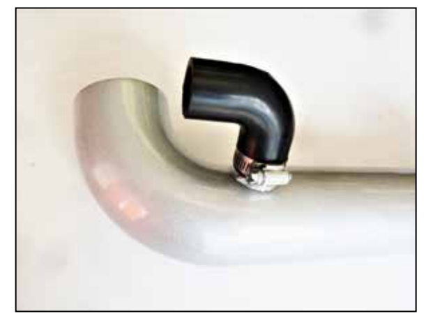
16. Cut 9" off the straight section of the provided BOV hose and then install the 90-degree section onto the intake tube and secure with the provided hose clamp.