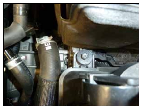
7. Remove the rear air filter housing mounting bolt.