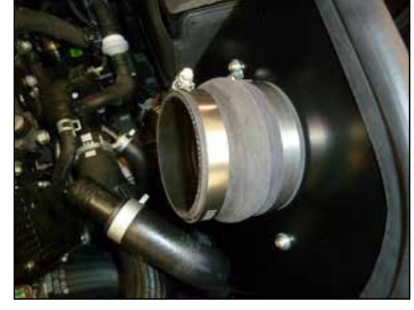
14. Install the hump hose onto the filter adapter and secure with the provided hose clamp.