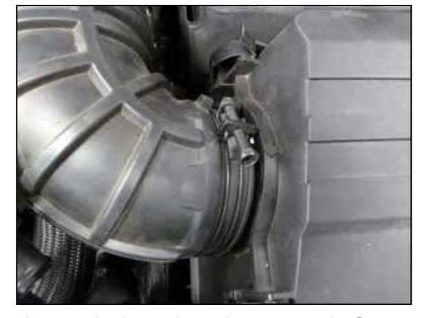
5. Loosen the hose clamp that secures the factory intake tube to the air filter housing and then remove the intake tube from the vehicle.