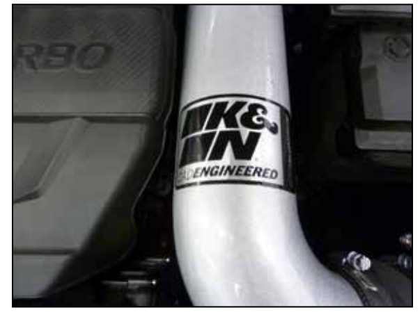
21. Install the K&N decal onto the intake tube as shown.