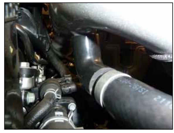
19. Connect the BOV hose to the union installed into the 90 degree hose on the intake tube and secure with the factory spring clamp.