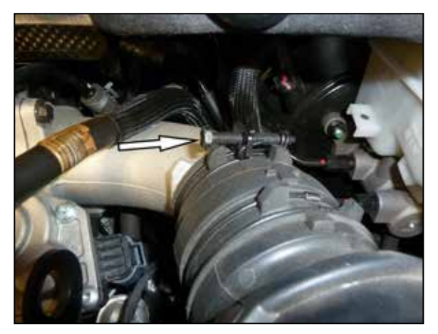
4. Loosen the hose clamp that secures the factory intake tube to the turbo inlet.