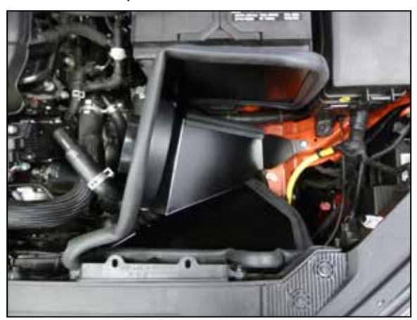
11. Install the heat shield assembly into the vehicle and secure with the provided hardware.