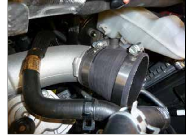
13. Install the step coupler onto the turbo inlet and secure with the provided hose clamp.