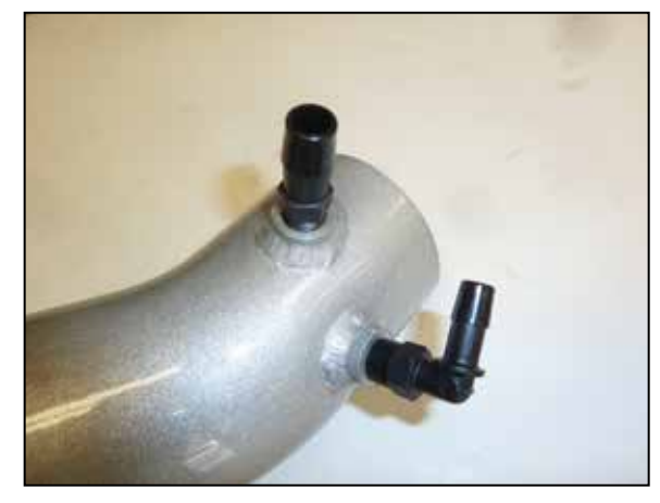
15. Install the provided CCV and EVAP fittings into the intake tube as shown. Apply pipe thread sealant to the threads before installation.