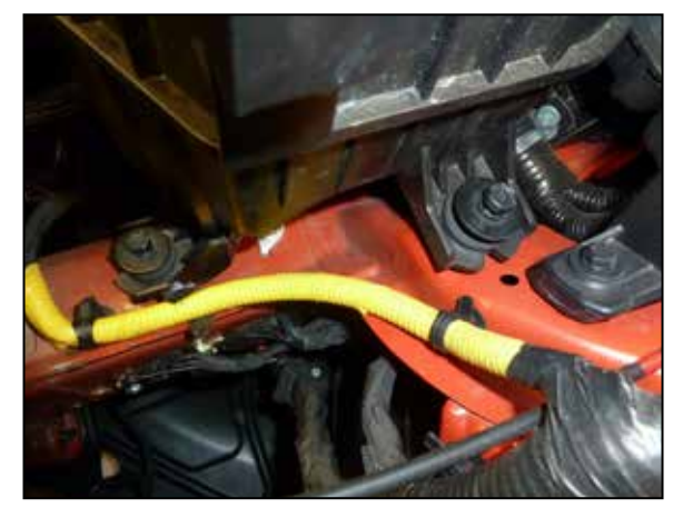
8. Remove the two remaining air filter housing mounting bolts and then remove the air filter housing from the vehicle.