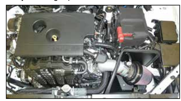
21. Reconnect the vehicle's negative battery cable. Double check to make sure everything is tight and properly positioned before starting the vehicle.

22. It will be necessary for all K&N® high flow intake systems to be checked periodically for realignment, clearance and tightening of all connections. Failure to follow the above instructions or proper maintenance may void warranty.