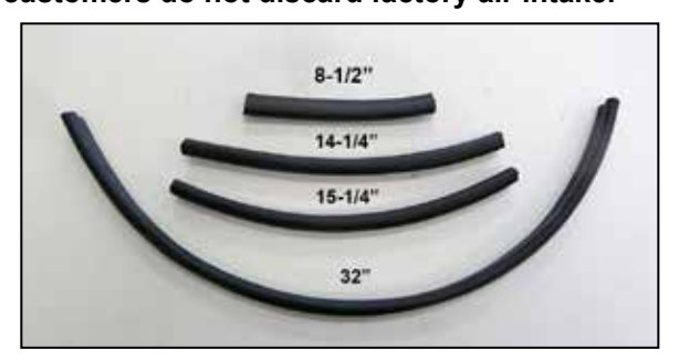
8. Cut the provided edge trim into four sections as shown.

NOTE: K&N Engineering, Inc., recommends that customers do not discard factory air intake.