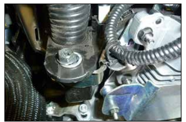
11. Remove the bolt that secures the wiring harness shown.