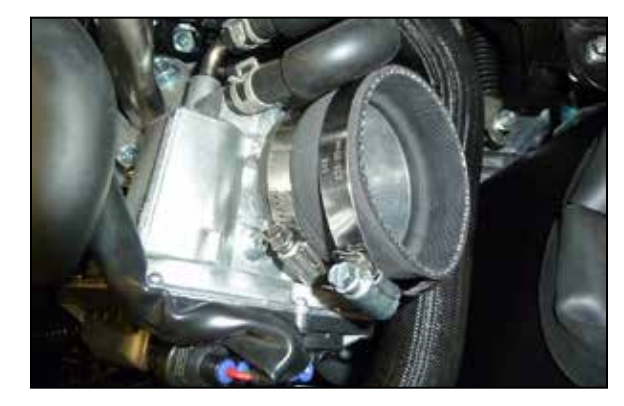
13. Install the provided coupler (08186) onto the throttle body and secure with the provided hose