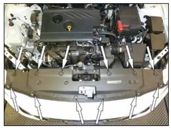
2. Remove the twelve plastic retaining clips that secure the upper valence and then remove the valence from the vehicle.

NOTE: Disconnecting the negative battery cable erases pre-programmed electronic memories. Write down all memory settings before disconnecting the negative battery cable. Some radios will require an anti-theft code to be entered after the battery is reconnected. The anti-theft code is typically supplied with your owner's manual. In the event your vehicles anti-theft code cannot be recovered, contact an authorized dealership to obtain your vehicles anti-theft code.