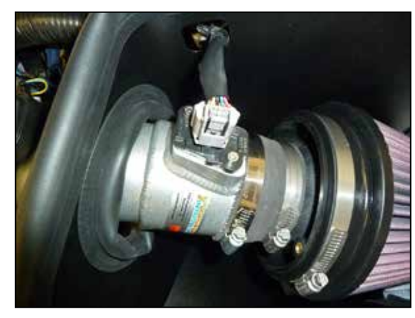
19. Reconnect the mass air sensor electrical connection.