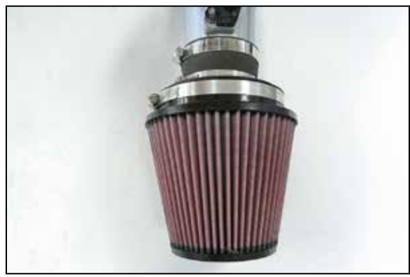
16. Install the K&N® air filter onto the filter adapter and secure with the provided hose clamp.