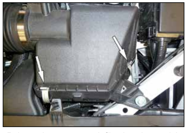
5. Release the two upper air filter housing retaining clips and then remove the upper air filter housing and intake boot from the vehicle.