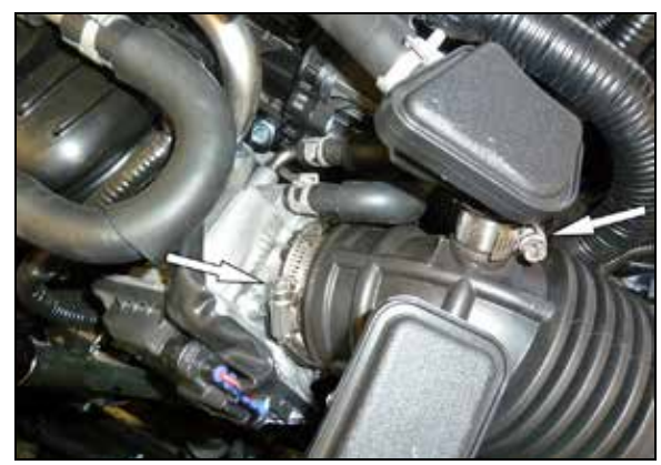
4. Loosen the clamp that secures the PCV chamber to the intake boot and then separate the chamber from the intake boot. Loosen the hose clamp that secures the intake boot to the throttle body.