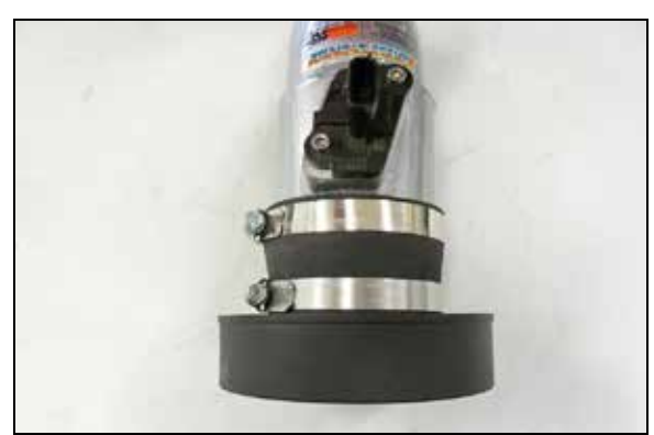
15. Remove the mass air sensor from the factory housing and then install it into the K&N® intake tube and secure with the provided hardware. Install the coupler (084036) onto the K&N® intake tube and then install the filter adapter into the coupler and secure them with the provided hose clamp.