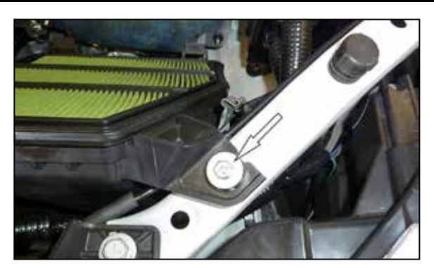
7. Remove the bolt that secures the lower air filter housing and then remove the housing from the vehicle.

NOTE: K&N Engineering, Inc., recommends that customers do not discard factory air intake.