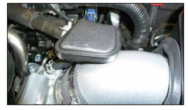
18. Install the PVC chamber into the grommet in the K&N® intake tube.