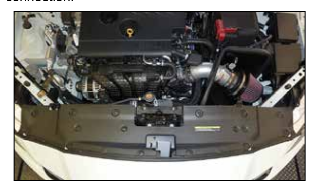
20. Reinstall the valence and secure with the factory retaining clips.