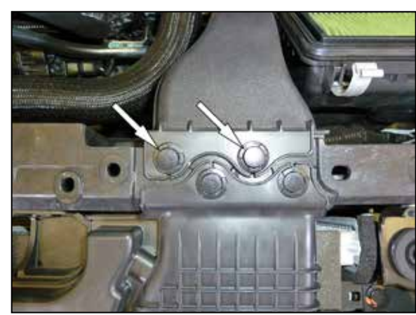
6. Remove the two plastic clips that retain the fresh air intake duct and then remove the duct from the vehicle.