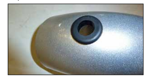
14. Install the provided grommet into the K&N® intake tube.