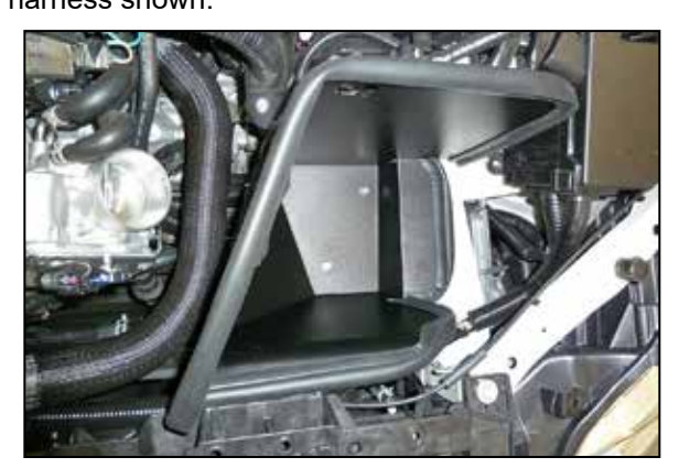
12. Install the heat shield into the vehicle so the mounting studs insert into the factory mounting grommets then secure the heat shield and wiring harness with the hardware provided.