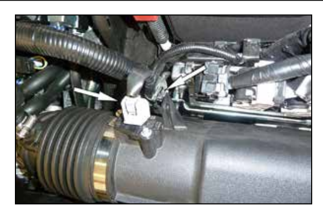
3. Disconnect the mass air sensor electrical connection and then unhook the harness from the air filter housing and engine.