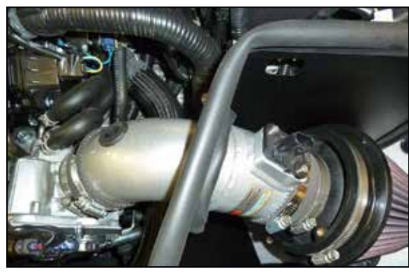
17. Install the intake tube through the heat shield and into the coupler at the throttle body, adjust the tube for best fit and then secure with the provided hose clamp.