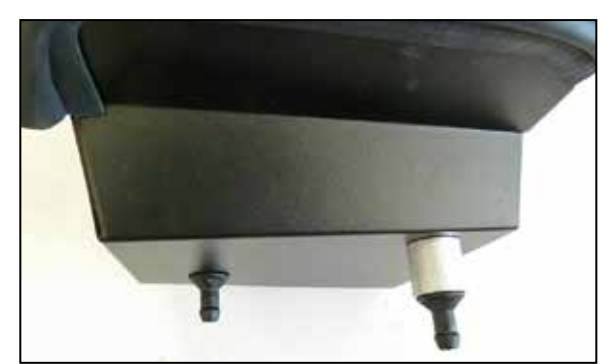
10. Install the heat shield mounting studs as shown using the provided hardware and spacer.