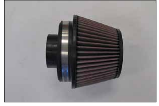
9. Install the K&N<sup>®</sup> air filter onto the provided filter adapter and secure with the provided hose clamp.