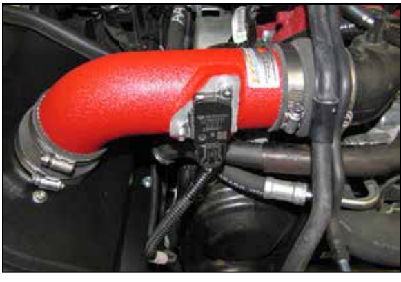
15. Reconnect the mass air sensor electrical connection.

14. Install the K&N<sup>®</sup> intake tube into the coupler at the turbo inlet tube and align with the filter adapter, slide the coupler onto the filter adapter, adjust the tube for best fit and secure with the hose clamps. Secure the heat shield with the provided hardware.