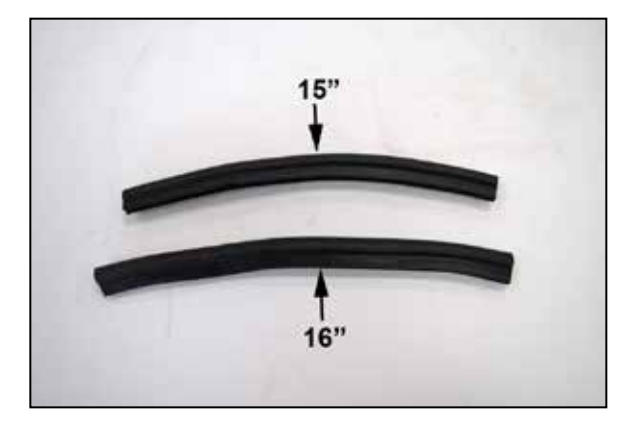
7. Cut the provided edge trim into two sections, one 15" long and one 16" long.