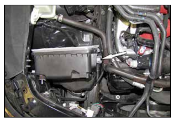
6. Remove the bolt that secures the dirty side air filter housing to the frame rail and then remove the air filter housing from the vehicle.

housing to the inner fender and then remove the bracket from the vehicle.