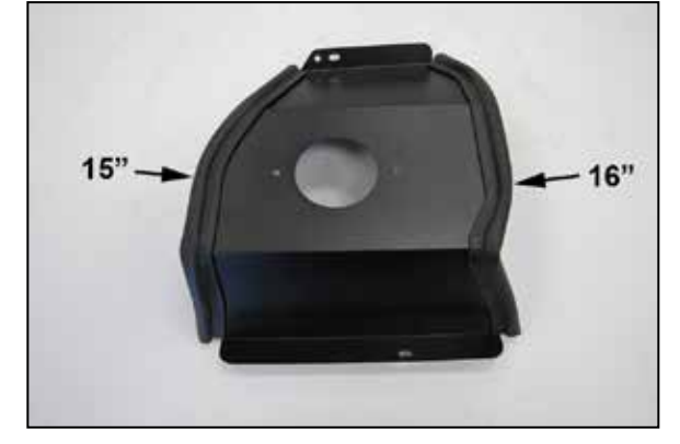
8. Install the edge trim onto the heat shield as shown.