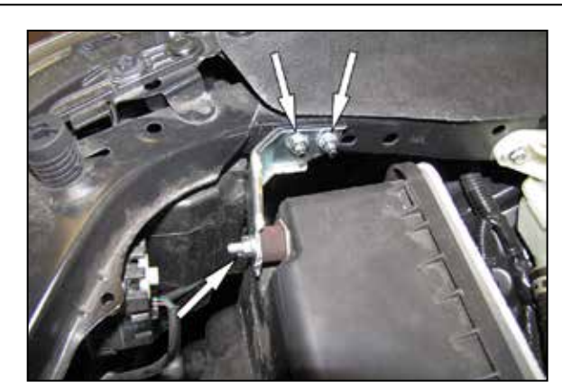
5. Remove the three nuts that secure the air filter