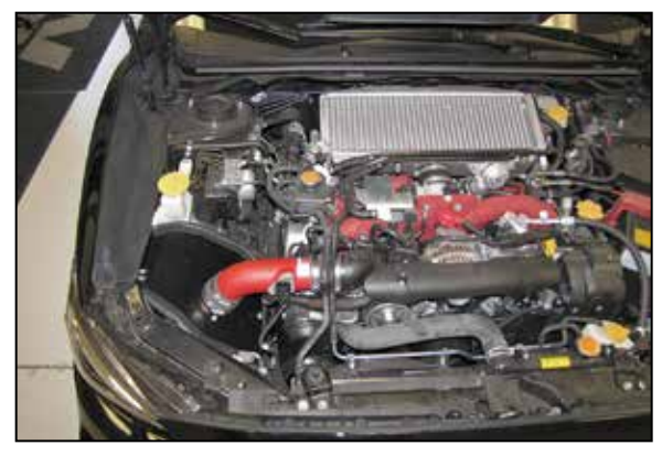
16. Reconnect the vehicle's negative battery cable. Double check to make sure everything is tight and properly positioned before starting the vehicle.

NOTE: Due to varying manufacturer tolerances, it may be necessary to use the provided extension harness.