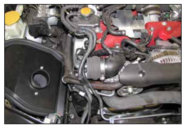
13. Install the provided hump coupler (08185) onto the turbo inlet tube. Set the heat shield assembly into position on the inner fender but do not secure.

12. Install the provided hose coupler (084036) onto the intake tube. Do not completely tighten the hose clamp at this time.