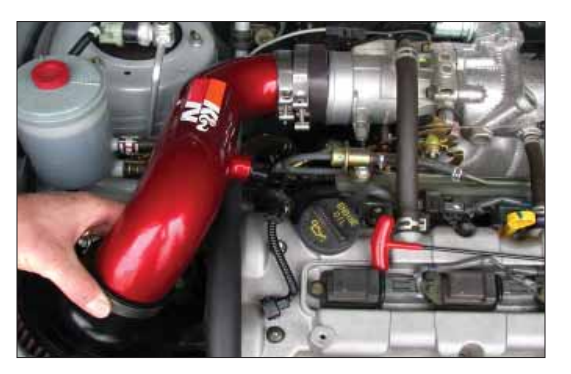
14. Install the intake tube assembly onto the throttle body as shown.