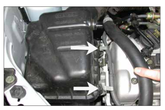
4. Unclip the upper air cleaner assembly as shown.