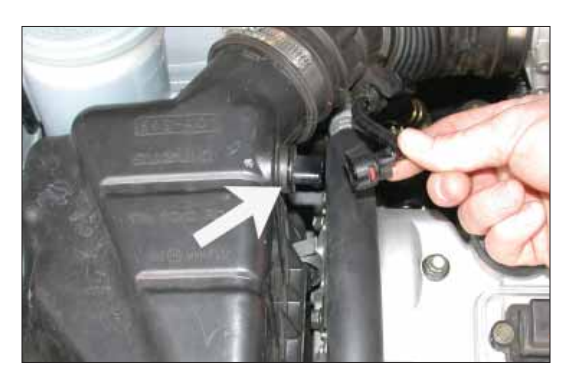
2. Disconnect the air temperature sensor electrical connection as shown

NOTE: Disconnecting the negative battery cable erases pre-programmed electronic memories. Write down all memory settings before disconnecting the negative battery cable. Some radios will require an anti-theft code to be entered after the battery is reconnected. The anti-theft code is typically supplied with your owner's manual. In the event your vehicles' anti-theft code cannot be recovered, contact an authorized dealership to obtain your vehicles anti-theft code.