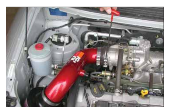
16. Tighten the hose clamp on the throttle body as shown.

15. Line up the bracket with the threaded hole from step 9 and secure with the stock bolt from step 9.