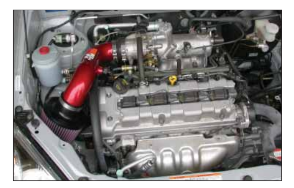
##. Reconnect the vehicle's negative battery cable. Double check to make sure everything is tight and properly positioned before starting the vehicle.

##. The C.A.R.B. exemption sticker, (attached), must be visible under the hood, so the emissions inspector can see it when the vehicle is required to be tested for emissions. California requires testing every two years, other states may vary.