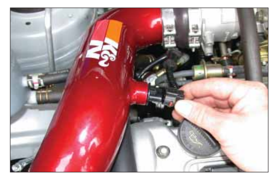
17. Reconnect the air temperature sensor electrical connection as shown.