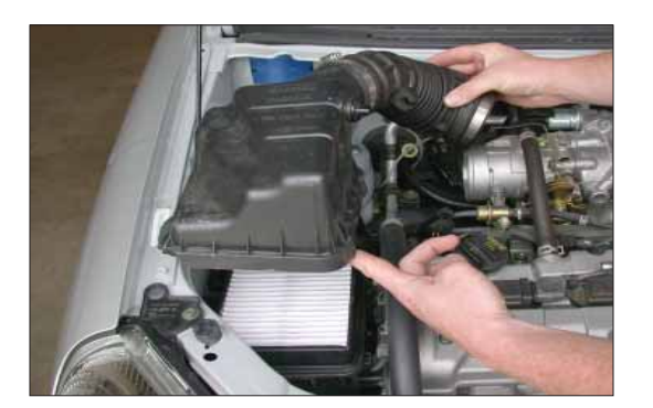
5. Pull the stock intake hose off the throttle body and remove the upper air cleaner assembly as shown.