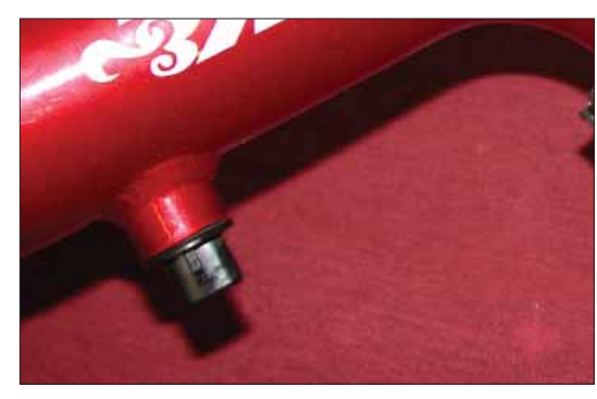
11. Install the air temperature sensor into the silicone hose on the intake tube as shown.

NOTE: Before installing the silicone hose, inspect the inside of the tube for any debris, then clean the inside out with water and a towel. Inspect the tube one more time before proceeding to the next step.