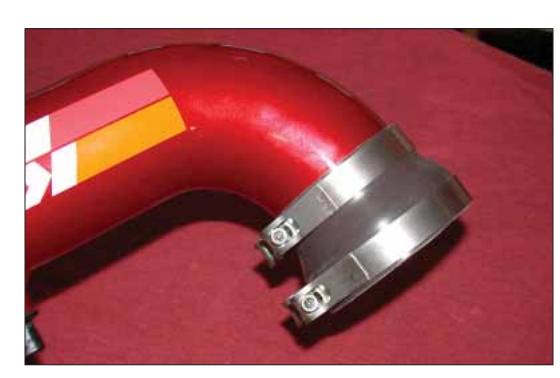
12. Install the silicone hose and hose clamps onto the intake tube as shown.