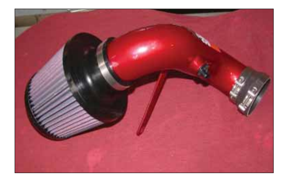
13. Install the air fitler onto the intake tube as shown.