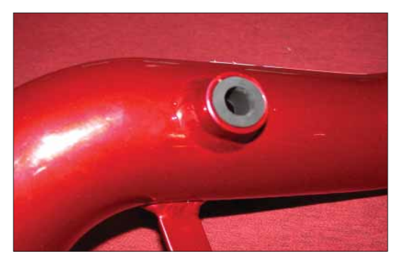
10. Install the silicone hose into the vent on the Typhoon intake tube as shown.

NOTE: Before installing the silicone hose, inspect the inside of the tube for any debris, then clean the inside out with water and a towel. Inspect the tube one more time before proceeding to the next step.