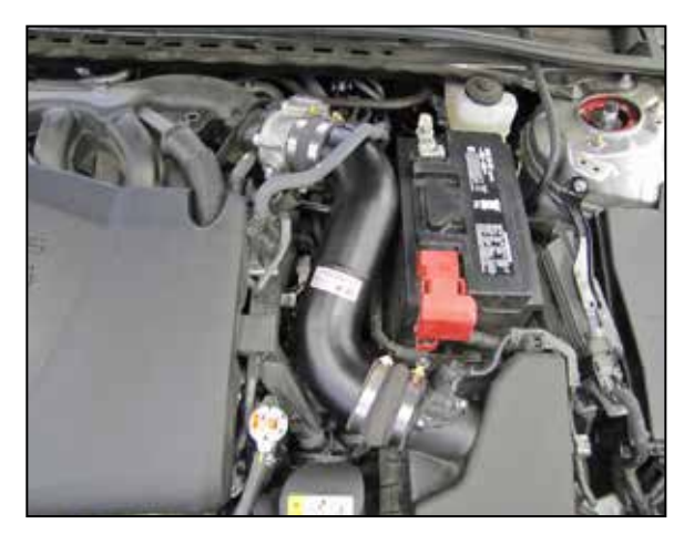
7. Install the K&N® intake tube into the coupler at the throttle body and then into the coupler at the air filter housing, adjust the tube for best fit and then secure with the provided hose clamps. Connect the crank case vent line to the fitting installed into the K&N® intake tube.