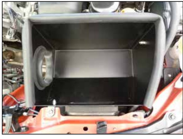
12. Set the heat shield into position on the core support and secure with the factory air box mounting bolts and to the previously install bracket with the hardware provided.