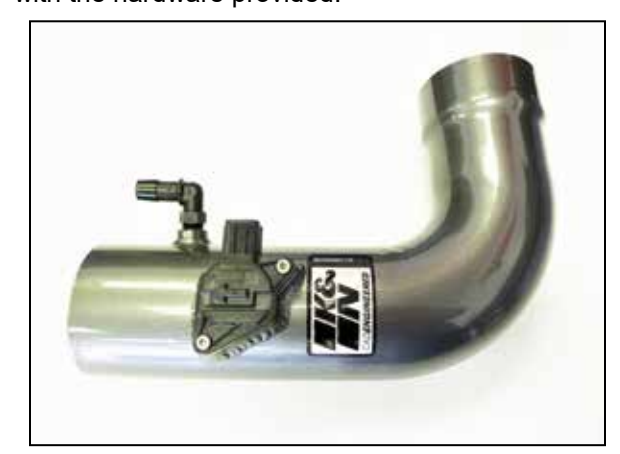
13. Remove the mass air sensor from the factory air filter housing and then install it into K&N intake tube using the provided hardware. Install the provided 90* vent fitting into the K&N intake tube as shown. Apply the K&N decal as shown.