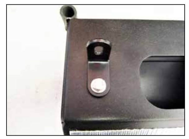
11. Install the provided "L" bracket (070066) onto the heat shield using the provided hardware.