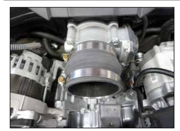
7. Install the provided silicone hose (08171) onto the throttle body and secure with the provided hose clamp.