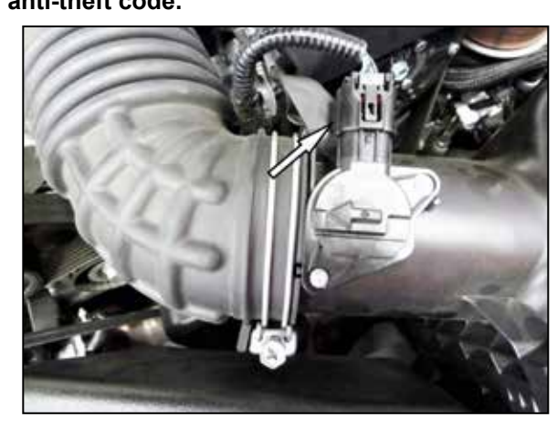
2. Disconnect the mass air sensor electrical connection and unhook the wiring harness from the air box.

NOTE: Disconnecting the negative battery cable erases pre-programmed electronic memories. Write down all memory settings before disconnecting the negative battery cable. Some radios will require an anti-theft code to be entered after the battery is reconnected. The anti-theft code is typically supplied with your owner's manual. In the event your vehicles anti-theft code cannot be recovered, contact an authorized dealership to obtain your vehicles anti-theft code.