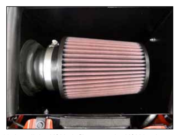
16. Install the K&N air filter onto the K&N intake tube and secure with the provided hose clamp.