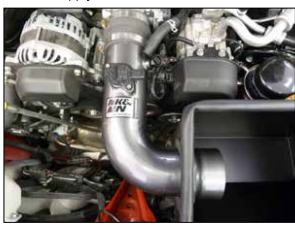
14. Install the tube through the heat shield. Rotate the tube down and install it into the silicone hose on the throttle body. Secure the tube with the provided hose clamp. NOTE: The tube is a tight fit through the opening, take care so as not to damage the edge trim.