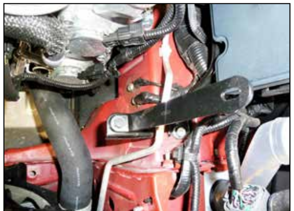
6. Install the provided heat shield mounting bracket (070026) onto the lower air box mount using the factory bolt.