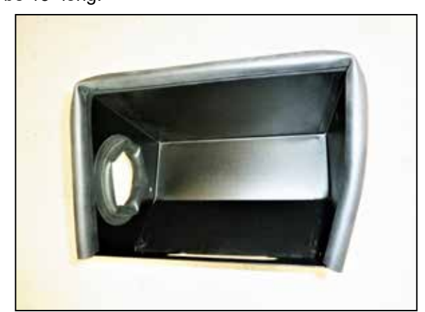
10. Install the 13" long section of edge trim into the hole of the heat shield as shown and then install the 27" long section of edge trim onto the top of the heat shield as shown.