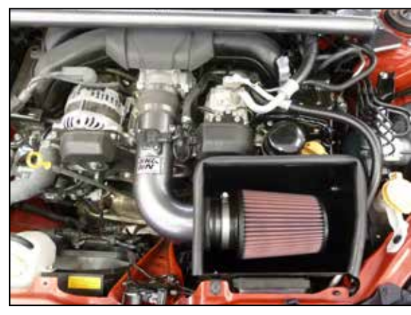
17. Reconnect the vehicle's negative battery cable. Double check to make sure everything is tight and properly positioned before starting the vehicle.

18. It will be necessary for all K&N® high flow intake systems to be checked periodically for realignment, clearance and tightening of all connections. Failure to follow the above instructions or proper maintenance may void warranty.