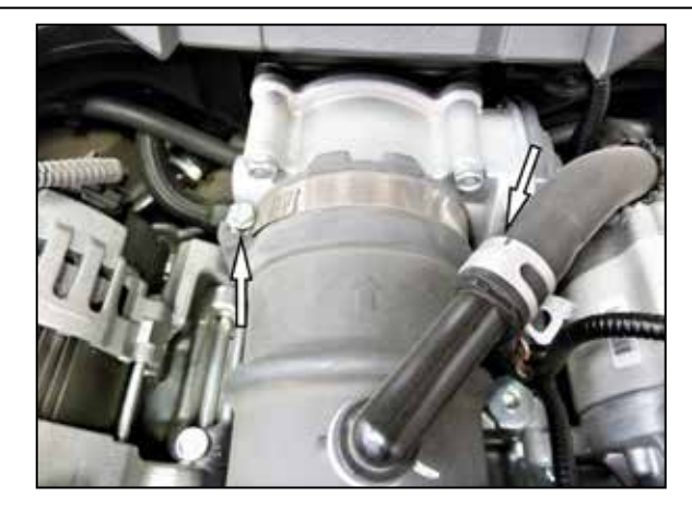
3. Release the spring clamp and then disconnect the crank case vent hose from the fitting. Loosen the hose clamp securing the intake hose to the throttle body.