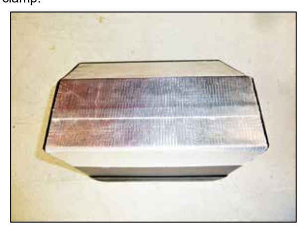
8. Install the provided heat shield insulation strips onto the bottom of the heat shield as shown. Some trimming of the insulation strips excess will be necessary.