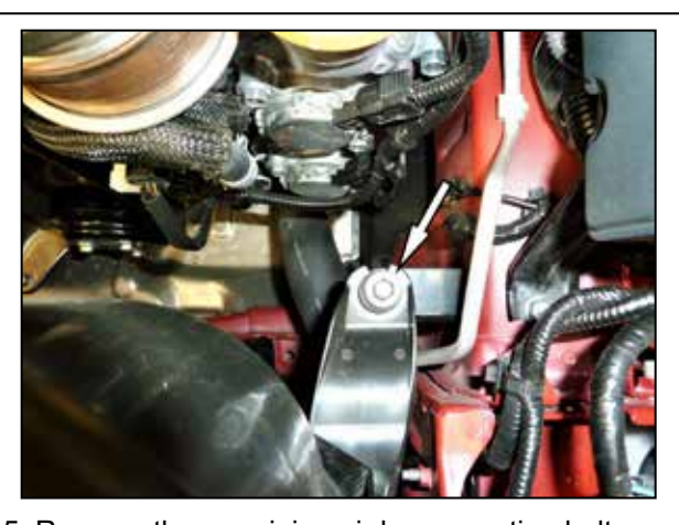
then lift up the air box assembly and remove it from the vehicle. NOTE: This bolt will be reused in a later step.