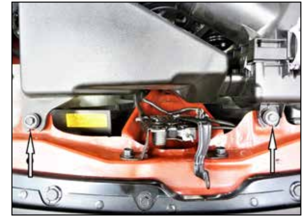
4. Remove the two bolts shown securing the resonator and air box to the core support. NOTE: These bolts will be reused in a later step.