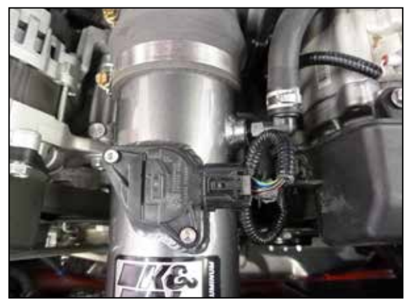
15. Connect the crank case vent to the fitting installed into the K&N intake tube as shown. Reconnect the mass air sensor electrical connection.