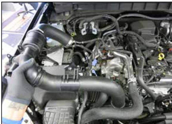
22. Remove the hot-side charge pipe from the vehicle.