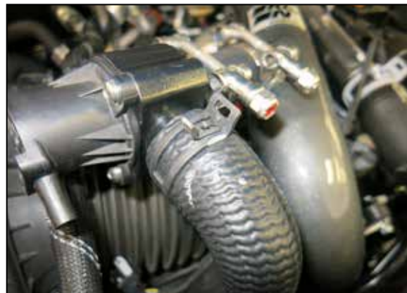
30. Reconnect the BOV valve electrical connection.