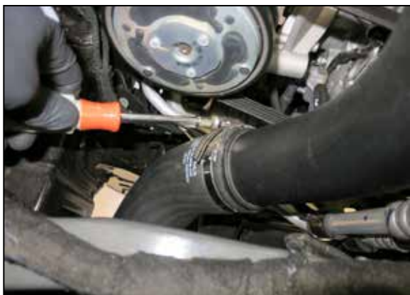
19. Loosen the hose clamp that secures the hot-side charge tube to the intercooler inlet hose.