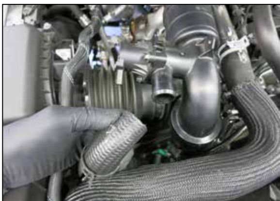
21. Release the spring clamp securing the BOV hose to the BOV and then disconnect the BOV hose.