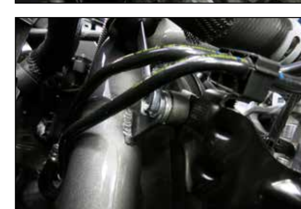
29. Install the BOV assembly onto the charge pipe and position so the outlet aligns with the BOV hose, Install the BOV hose onto the BOV and secure with the factory spring clamp. Then tighten the hose clamp to secure the valve assembly on to the charge pipe.