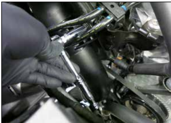
20. Remove the bolt that secures the charge tube to the mount.