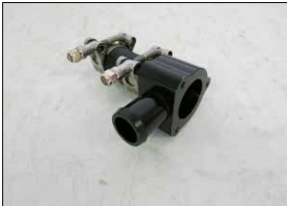
23. Install the provided BOV hose onto the K&N BOV manifold and secure with the provided hose clamp.