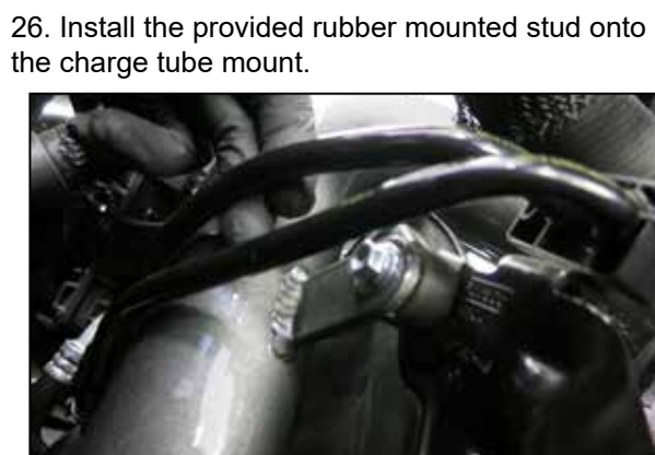
26. Install the provided rubber mounted stud onto the charge tube mount.