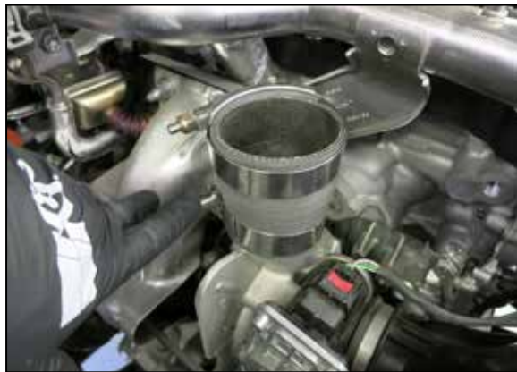
25. Install the provided step hose onto the turbo outlet and secure with the provided hose clamp.