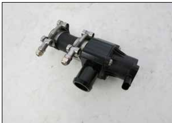
24. Remove the BOV from the factory charge tube and install it onto the K&N BOV manifold using the provided hardware.