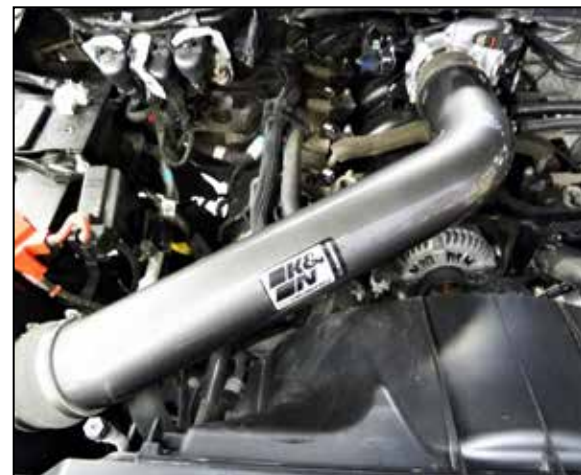
18. Install the K&N intake tube into the hump coupler and then into the straight coupler, adjust for best fit and then secure with the provided hose clamps.