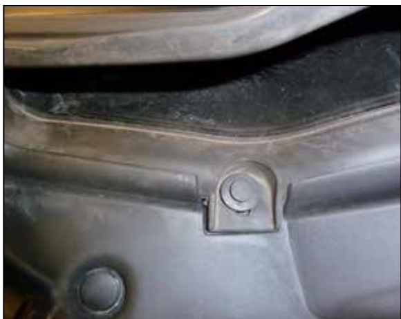
7. Remove the push-pin that secures the fresh air duct and then remove the fresh air duct from the vehicle.