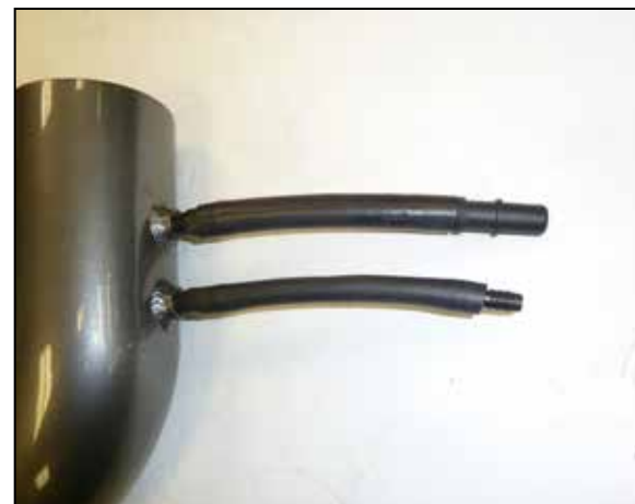
17. Install the provided vent hoses and fittings onto the K&N intake tube as shown.