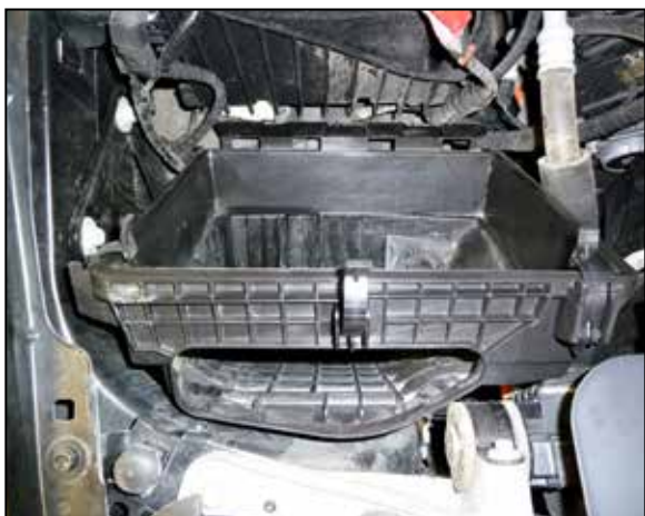
9. Pull the lower air filter housing up to dislodge it from the mounting grommets and then remove it from the vehicle.