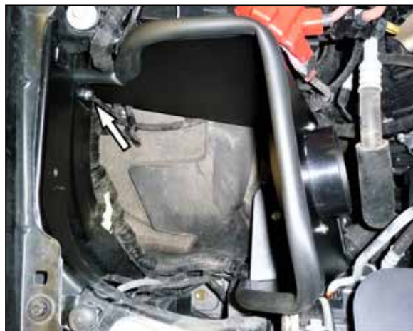
14. Install the heat shield so the mounting stud inserts into the mounting grommet and then secure to the inner fender with the provided hardware.