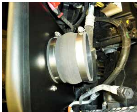
15. Install the provided hump coupler onto the filter adapter and secure with the provided hose clamp.