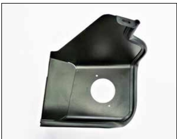
11. Install the provided edge trim onto the heat shield as shown. NOTE: Some trimming will be necessary.