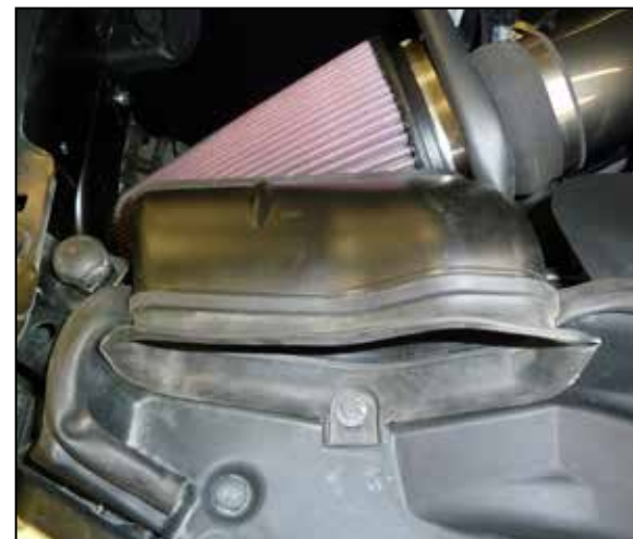
21. Reinstall the fresh air duct and secure with the factory push pin.