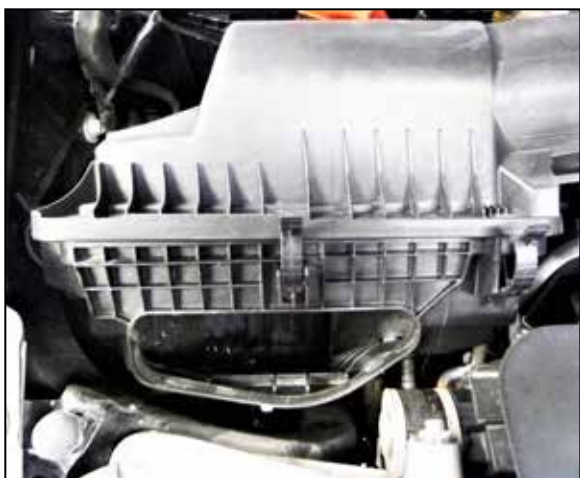
8. Release the three clips that secure the air filter lid and then remove the lid and factory air filter.