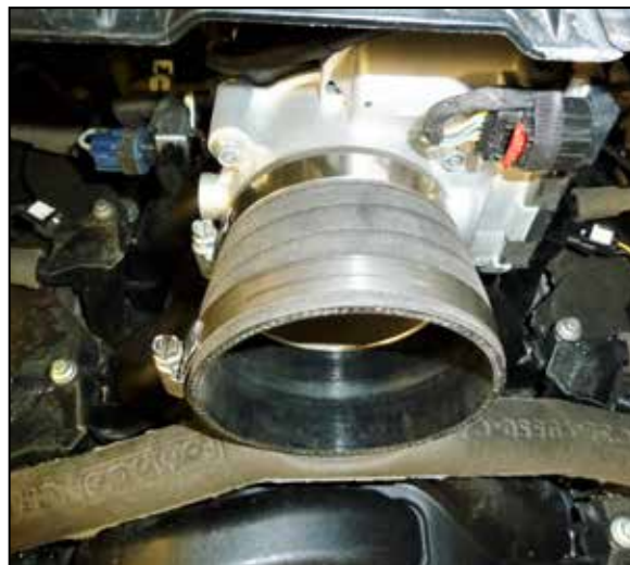
16. Install the straight coupler onto the throttle body and secure with the provided hose clamp.