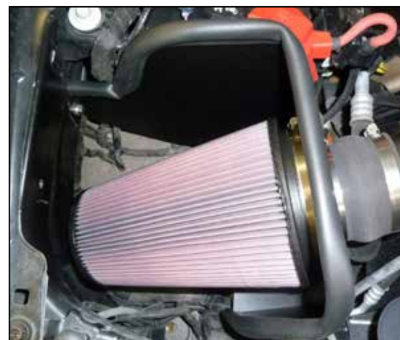
20. Install the K&N air filter onto the filter adapter and secure with the provided hose clamp.