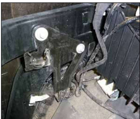
10. Remove the two bolts that secure the air filter housing mounting bracket to the inner fender and then remove the bracket from the vehicle.