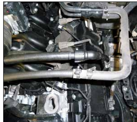
19. Connect the factory vent hoses to the hoses and fittings attached to the K&N intake tube.