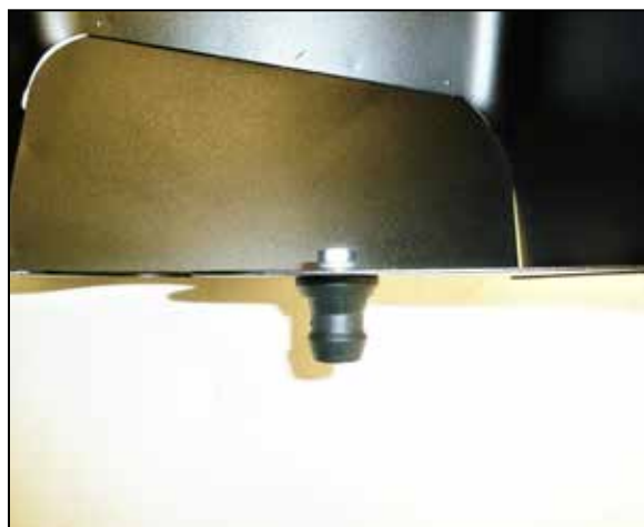
13. Install the mounting post onto the heat shield using the provided hardware.