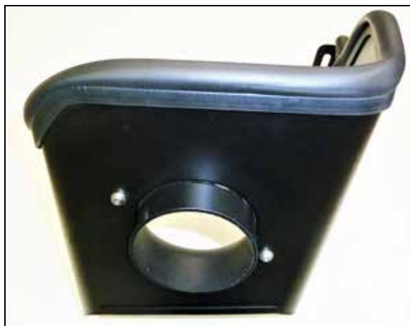
12. Install the filter adapter into the heat shield and secure with the provided hardware.