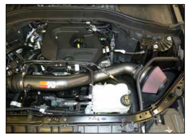
19. Reconnect the vehicle's negative battery cable. Double check to make sure everything is tight and properly positioned before starting the vehicle.

20. It will be necessary for all K&N<sup>®</sup> high flow intake systems to be checked periodically for realignment, clearance and tightening of all connections. Failure to follow the above instructions or proper maintenance may void warranty.