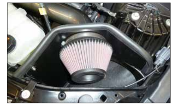
18. Install the K&N air filter and secure with the provided hose clamp.