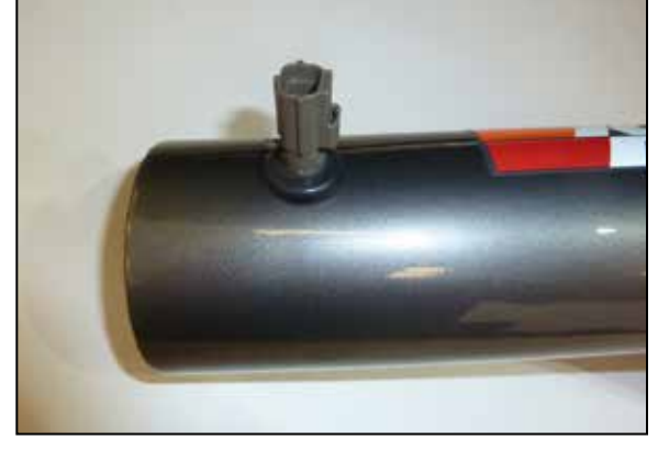
14. Remove the inlet air temperature sensor from the factory air filter housing, remove the O-ring and then install it into the K&N intake tube using the provided grommet.

13. Install the hump coupler onto the filter adapter and secure with the provided hose clamp.