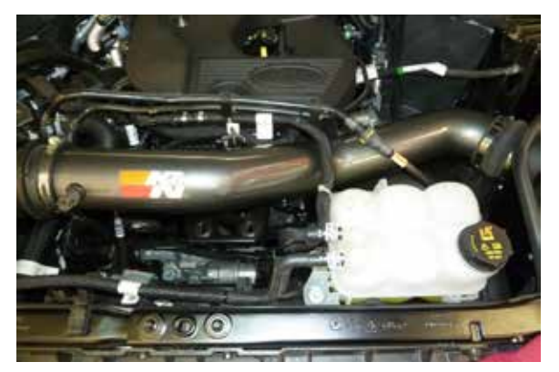
15. Install the intake tube into the factory turbo inlet and then into the hump coupler, align for best fit and then secure with the provided hardware.