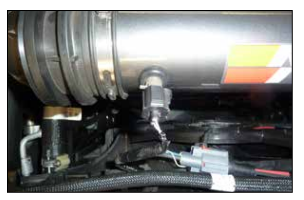
17. Reconnect the inlet temperature sensor electrical connection.

16. Secure the coolant hose using the provided tie wrap.