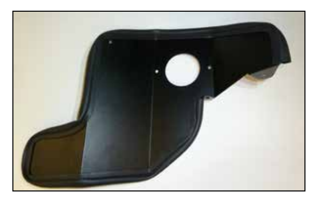
6. Install the provided edge trim onto the heat shield as shown, some trimming of the edge trim will be necessary.