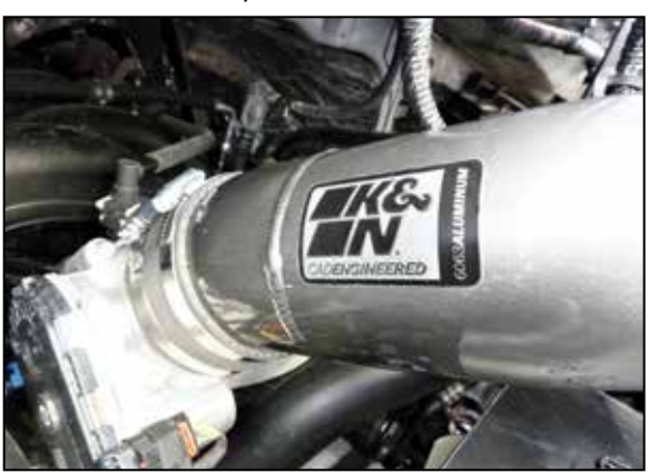
18. Apply the K&N decal where shown.