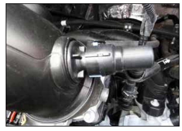
7. Disconnect the CCV quick connect fitting near the throttle body.