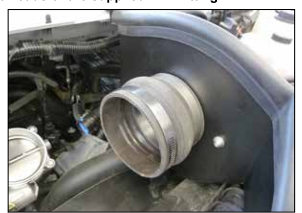
13. Install the provided hump coupler onto the filter adapter and secure with the provided hose clamp.