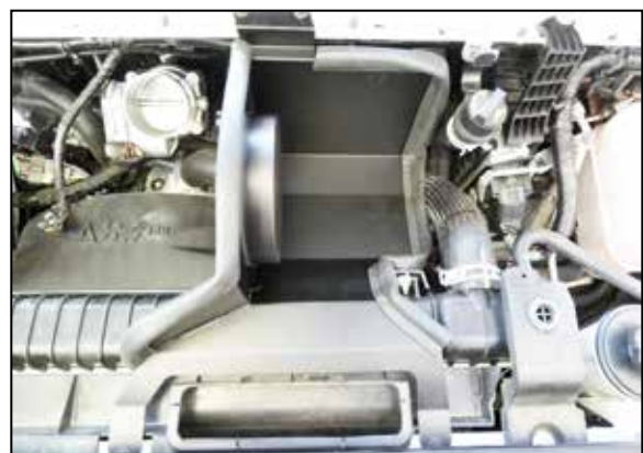
11. Install the heat shield assembly into the vehicle, position the provided spacers under the rear mounting location and then secure with the factory air filter housing mounting hardware.