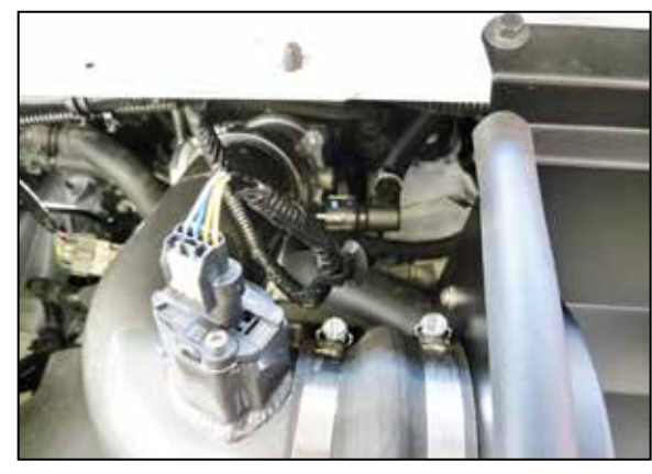
16. Connect the CCV quick connect fitting and mass air sensor electrical connection.