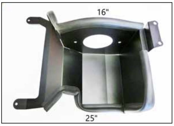
9. Cut the provided edge trim to 16" and 25" and then install onto the K&N heat shield as shown.