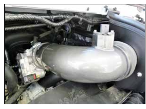
15. Install the K&N intake tube into the coupler at the throttle body and then into the coupler at the filter adapter, adjust for best fit and then secure with the provided hose clamps.