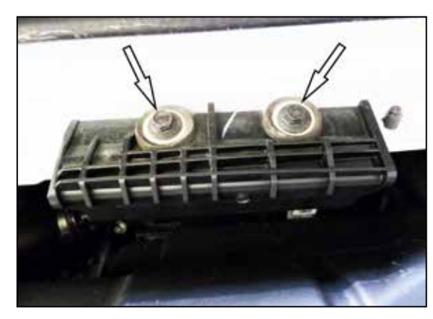
5. Remove the two bolts that secure the lower air filter housing to the cowl. These Bolts will be reused with the K&N intake system.