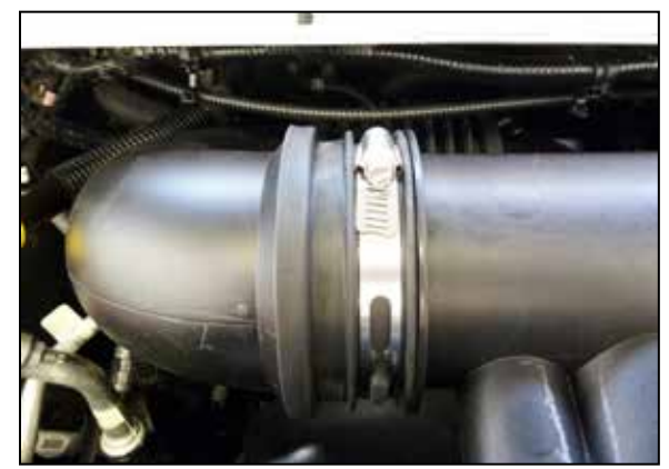
3. Loosen the hose clamp that secures the factory intake tube to the filter housing.