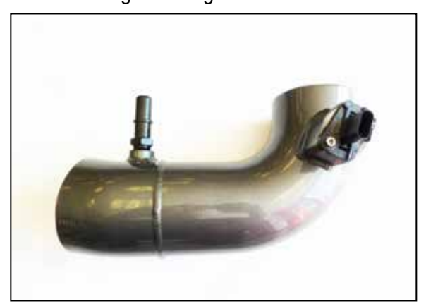
12. Remove the mass air sensor from the factory housing and install it into the K&N intake tube using the provided hardware. Install the provided CCV quick connect fitting into the K&N intake tube. NOTE: Be sure to use thread sealant on the threads of the supplied CCV fitting.