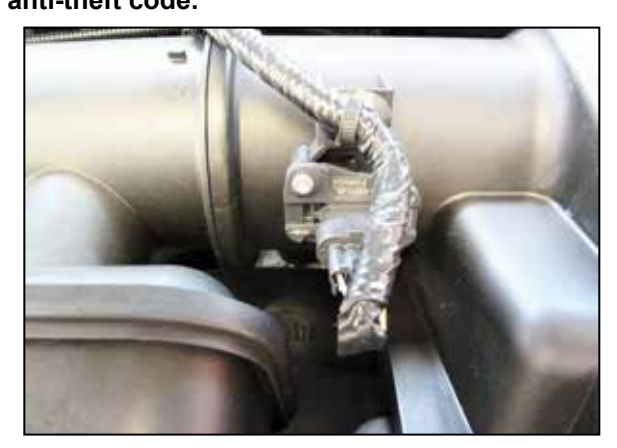
2. Disconnect the mass air sensor electrical connection and unhook the harness.

NOTE: Disconnecting the negative battery cable erases pre-programmed electronic memories. Write down all memory settings before disconnecting the negative battery cable. Some radios will require an anti-theft code to be entered after the battery is reconnected. The anti-theft code is typically supplied with your owner's manual. In the event your vehicles anti-theft code cannot be recovered, contact an authorized dealership to obtain your vehicles anti-theft code.