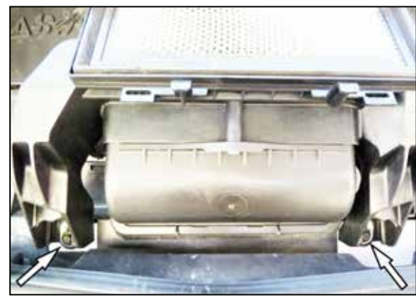
6. Remove the two front air filter housing mounting bolts then remove the lower air filter housing from the vehicle. These bolts will be reused.