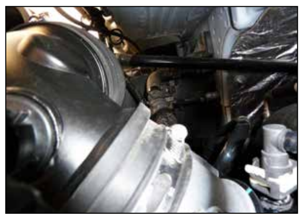
8. Loosen the hose clamp that secures the intake tube to the throttle body and then remove the intake tube from the vehicle.