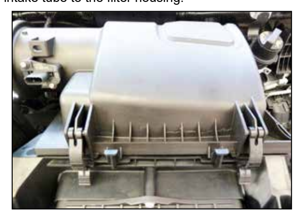
4. Release the locking clips and then remove the air filter housing from the vehicle.