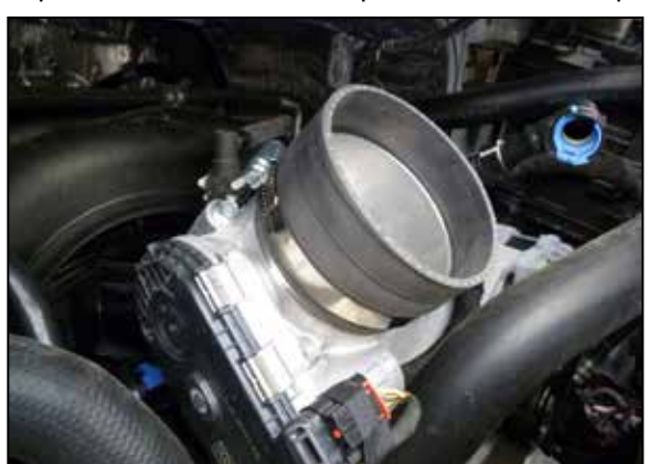
14. Install the provided straight coupler onto the throttle body and secure with provided hose clamp.