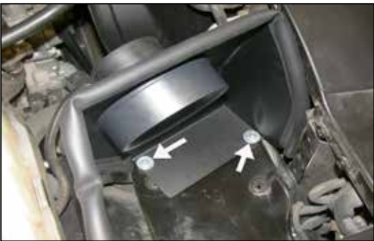
13. Secure the heat shield to the rubber mounted studs using the provided hardware but do not tighten at this time.