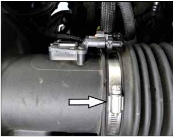
4. Loosen the hose clamp securing the intake hose to the air filter housing. Disconnect the mass air sensor electrical connection.