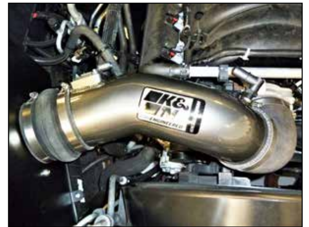
17. Install the intake tube into the couplers, adjust the coupler and tube for best fit and then secure with the provided hose clamps.