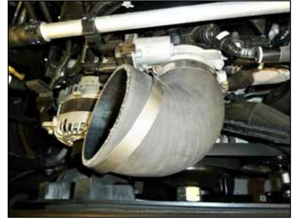
15. Install the angled coupler onto the throttle body but do not tighten the hose clamp at this time.