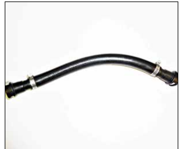
18. Assemble the CCV hose with the fittings, hose and clamps provided.