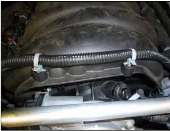
7. Disconnect the wiring harness from the intake manifold.