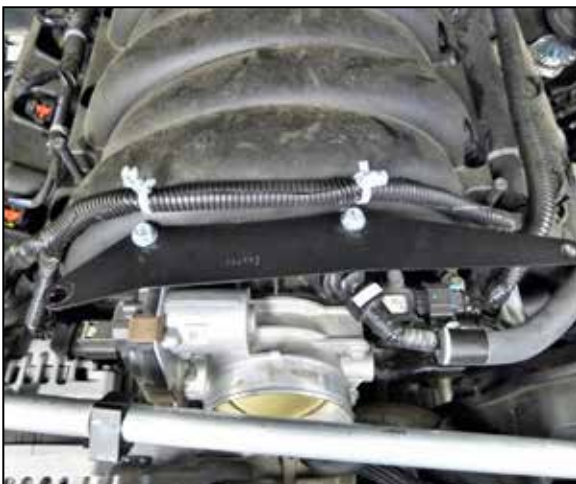
8. Install the provided mounting bracket onto the intake manifold using the provided hardware.