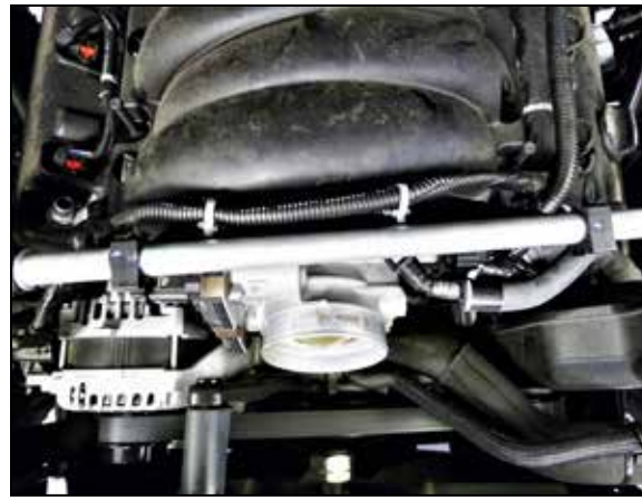
9. Secure the wiring harness and coolant pipe to the mounting bracket as shown.