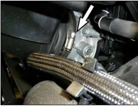
5. Loosen the hose clamp that secures the intake plenum to the throttle body. Remove the intake plenum from the vehicle.