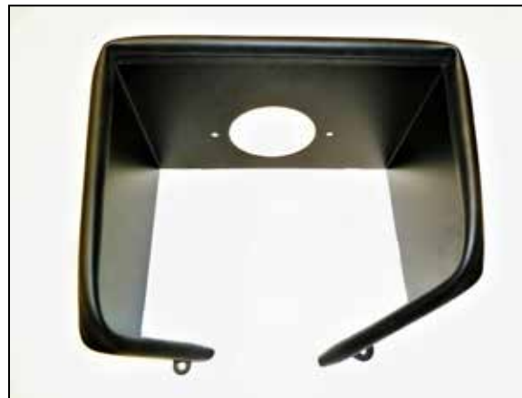
12. Install the provided edge trim onto the heat shield as shown. Some trimming of the edge trim will be necessary.