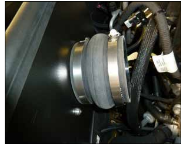
16. Install the hump coupler onto the filter adapter and secure with the provided hose clamp.