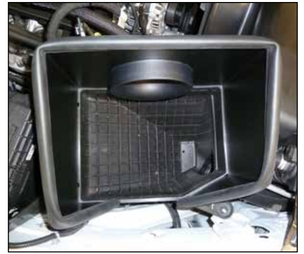
14. Install the heat shield assembly onto the factory lower air filter housing and secure with the seven screws provided.