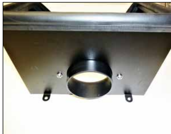
13. Install the filter adapter into the heat shield and secure with the provided hardware.