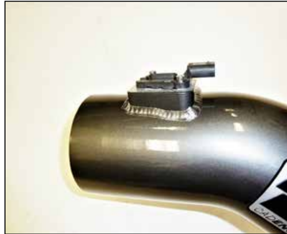
10. Remove the mass air sensor from the factory air filter housing and install it using the provided hardware.