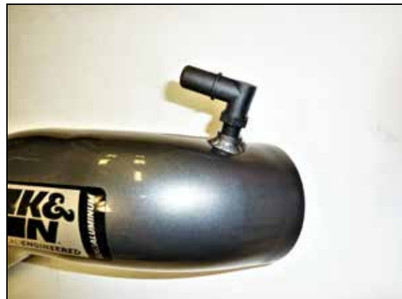
11. Install the provided 90deg quick connect fitting into the K&N intake tube as shown.