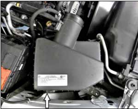
6. Loosen the seven screws that secure the upper air filter housing to the lower housing, then remove the upper housing and factory air filter.