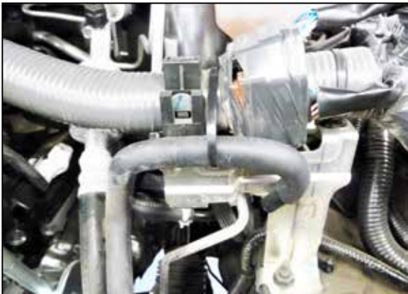
8. Use the provided tie wrap to secure the front differential vent to wiring harness as shown.