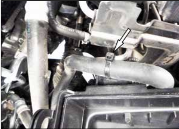
6. On 4X4 equipped vehicles, cut the tie wrap that secures the front differential vent line to the lower air filter housing. Lift the lower housing up and remove it from the vehicle.