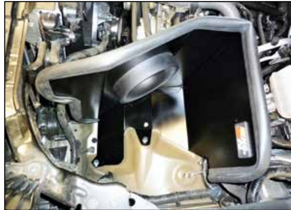
11. Install the heat shield into the vehicle and secure with the provided hardware.