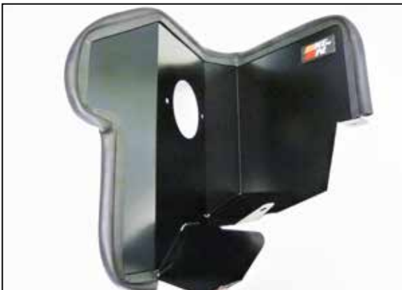
9. Install the provided edge trim onto the heat shield as shown. Install the K&N badge into the heat shield and lock with the provided locking plate.