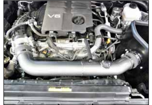
16. Install the K&N intake tube into the couplers, adjust for best fit and secure the hose clamps.