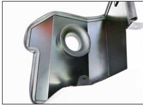
10. Install the filter adapter into the heat shield and secure with the provided hardware.