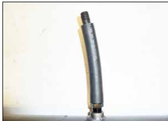
14. Assemble the CCV hose onto the K&N intake tube as shown.