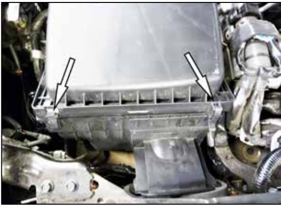
5. Release the spring clips that secure the upper air filter housing and then remove the upper housing and intake tube from the vehicle.