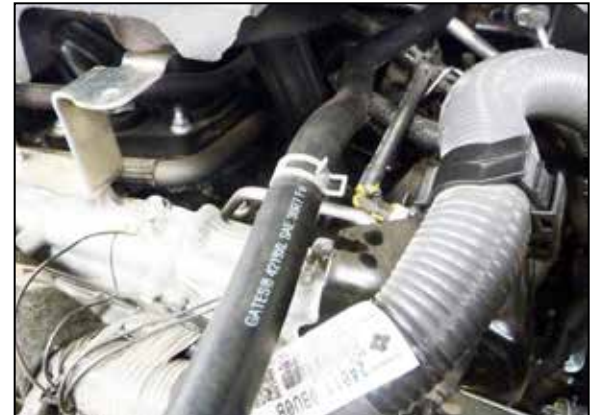
17. Connect the factory CCV hose to the Assemble K&N CCV hose.