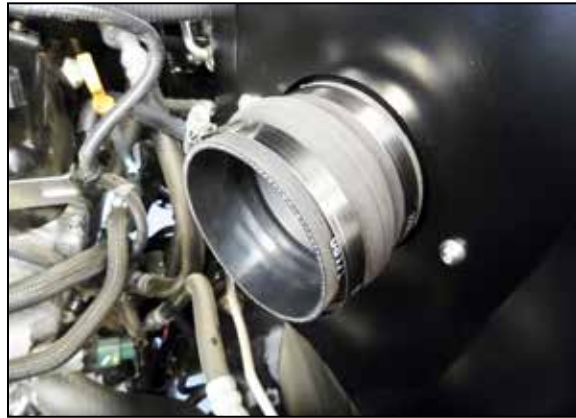
12. Install the provided hump coupler onto the filter adapter using the provided hose clamp.