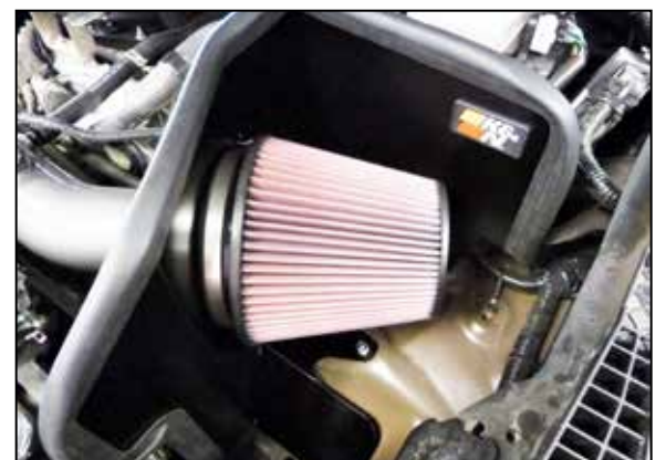
19. Install the K&N air filter and secure with the provided hose clamp.