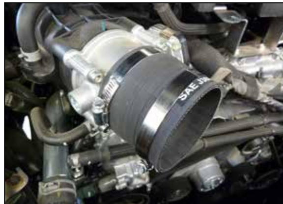
13. Install the straight coupler onto the throttle body and secure with the provided hose clamp.