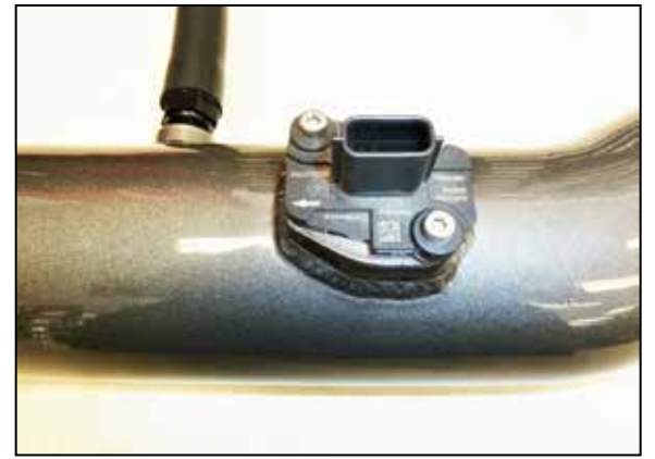
15. Remove the mass air sensor from the factory housing and install it into the K&N intake tube using the provided hardware.