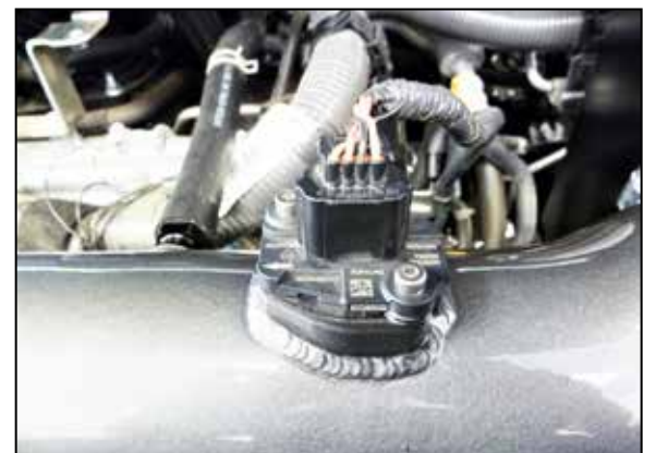
18. Reconnect the mass air sensor electrical connection.