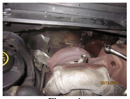
<u>CAUTION:</u> Up-pipe replacement is not for the average hobbyist. Access is very limited. Ford technicians remove the truck's cab to change these pipes. It is possible to do it without removing the cab with good tools, a lot of patience and some good luck. These instructions serve only as a guide for cab-on replacement.