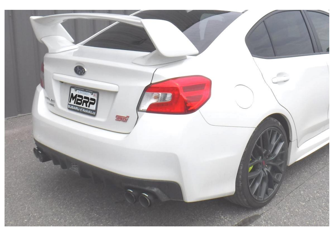
Congratulations! You are ready to begin experiencing the improved power, sound and driving experience of your MBRP Performance Exhaust. We know you will enjoy your purchase!