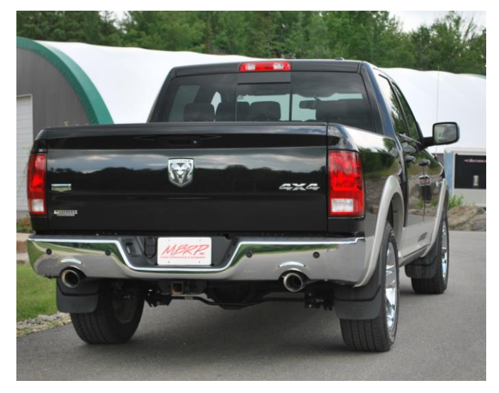
Congratulations! You are ready to begin experiencing the improved power, sound and driving experience of your MBRP performance exhaust system. We know you will enjoy your purchase.