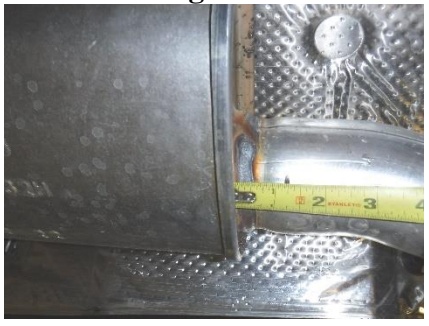
Figure 5 $7101 © 10/22