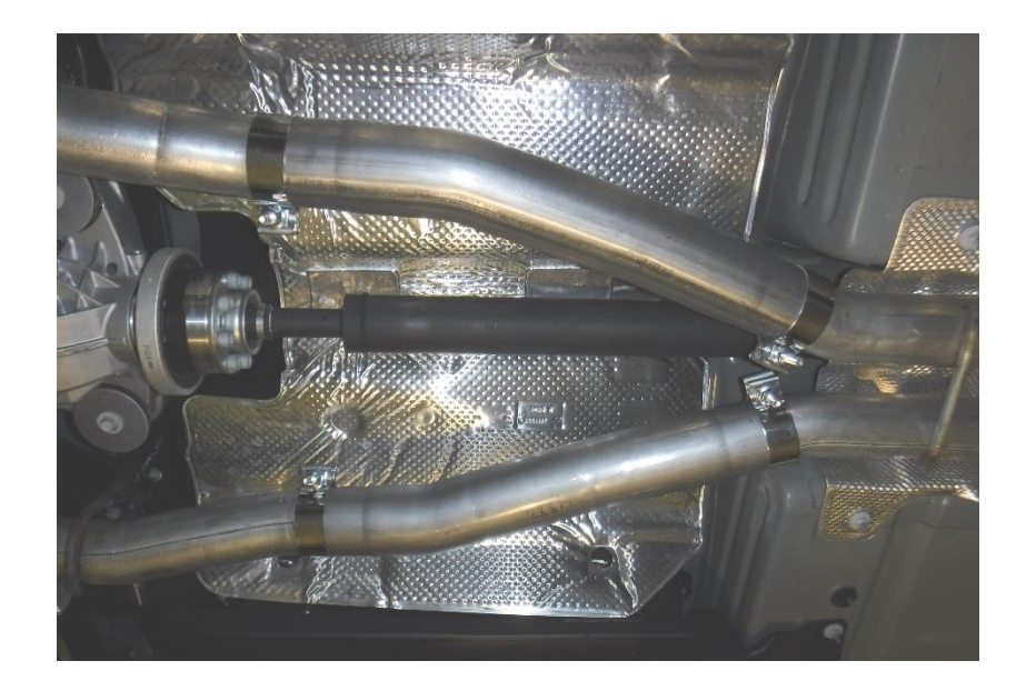
Congratulations! You are ready to begin experiencing the improved power, sound and driving experience of your MBRP Performance Exhaust. We know you will enjoy your purchase!

6. Carefully align the system and tips. Align the edge of each band clamp with the edge of the joint it is connecting. Tighten all hardware and clamps, starting at the front and working rearward to secure the system. Check along the full length of the exhaust system to ensure there is adequate clearance for fuel lines, vent lines, brake lines, frame, bodywork, suspension and any wiring, etc. If there is any interference detected, relocate or adjust to provide adequate clearance. Ensure all clamp connections are secure and components are unable to rotate or slide. Band clamps require approximately 45 lb-ft (60 N-m) of torque. Verify clearances, system security and band clamp torque after 30-60 miles (50-100 km) of driving.