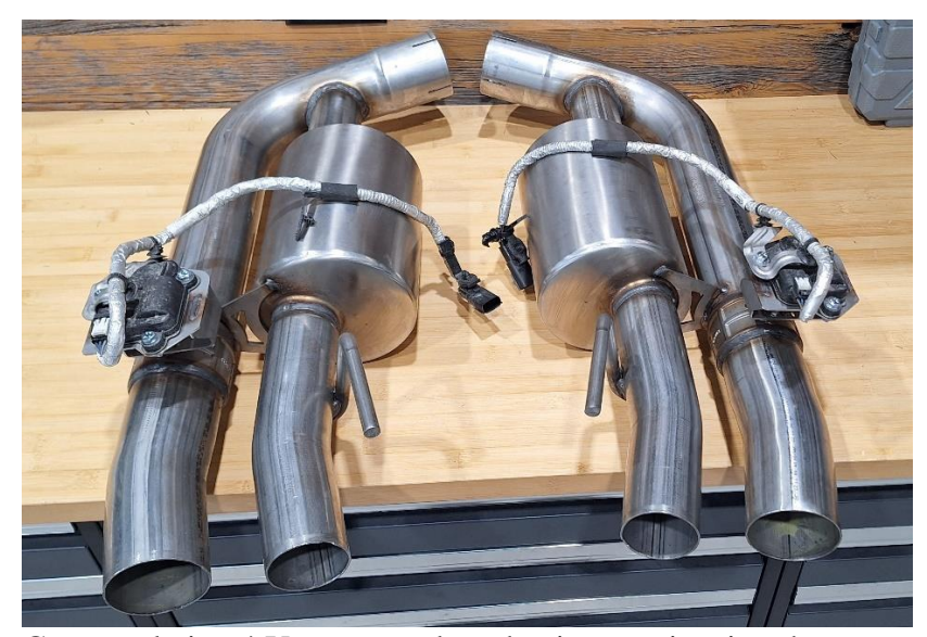
Congratulations! You are ready to begin experiencing the

12. Check along the whole length of the exhaust system to ensure that there is adequate clearance around fuel and brake lines or any other components. If any interference is detected relocate or adjust.