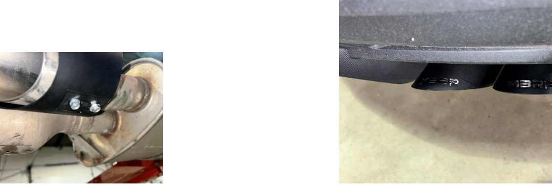
Congratulations! You are ready to begin experiencing the improved appearance of your MBRP Exhaust Tip Covers. We know you will enjoy your purchase!

5. Inspect the MBRP Exhaust Tip Covers for any interference. If there is any interference detected, relocate, or adjust to provide adequate clearance. Ensure all hardware connections are secure and components are unable to rotate or slide. Verify clearances, system security and hardware after 30-60 miles (50-100 km) of driving.