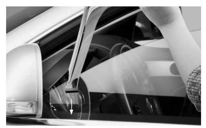
B Lower the front of the deflector onto the weatherstrip as shown. The weatherstrip molding may differ from vehicle to vehicle.