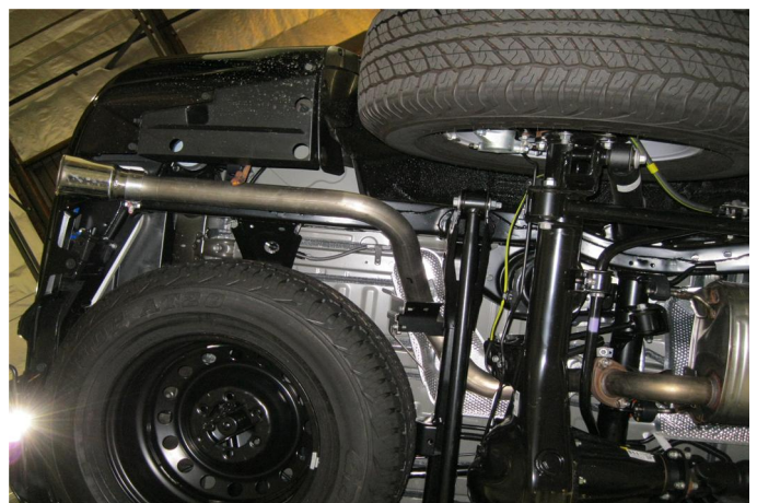
Step 2. Next unbolt the outlet of the OEM muffler at the inlet of the tail pipe assembly. Remove the welded hangers from the rubber insulators using a pry bar. do not discard or damage the insulators as they will be needed to install your new system. The OEM system may now be removed.

Step 1. Begin removing the OEM exhaust by unbolting the spring loaded coupling flange at the outlet of the OEM Y-Pipe that attaches to the muffler inlet with a 14mm socket.