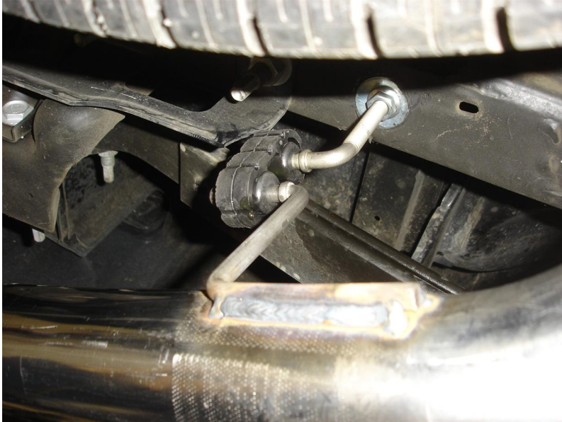
Fig # 1 Passenger Side

Step 3: Once a final position has been chosen for the new system, evenly tighten all fasteners from front to rear. The supplied band clamps must be VERY tight to properly align the pipes and prevent leaks (Approximately 40ft-lbs). U-bolt clamps should be tightened to approximately 30-35ft-lbs. Inspect all fasteners after 25-50 miles of operation and retighten if necessary.