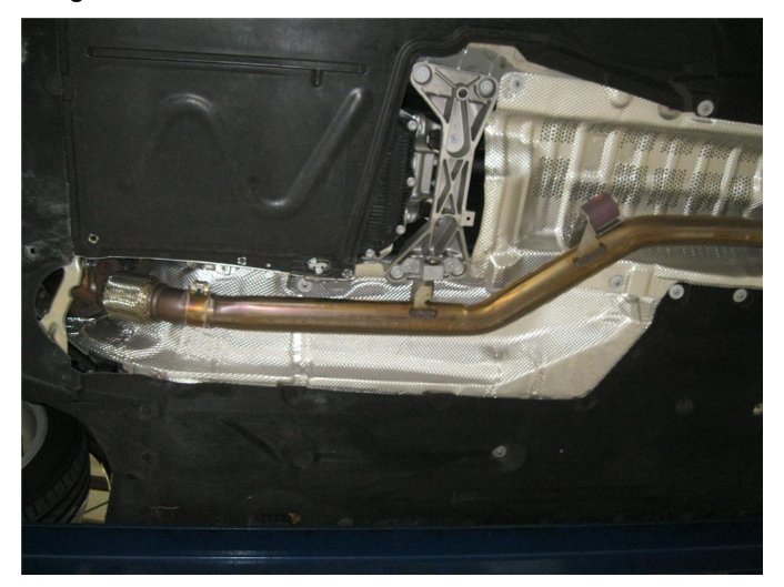
Step 2. Next, loosen the clamp attaching the inlet pipe to the flex pipe outlet. When removing the OEM system on this vehicle it is easier to unbolt the hanger assemblies with a #10 female TORX socket. The OEM exhaust system can now be removed in one piece. Retain all mounting hardware and rubber insulators as they will be needing to mount your new MAGNAFLOW system.