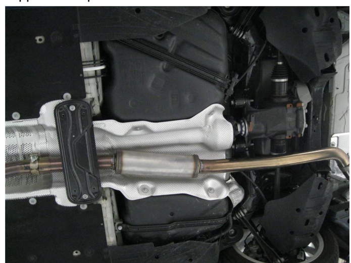
Step 4. Loosely install the Resonator and Muffler Tail Pipe Assemblies using the supplied.2.50" clamps. Reattach the OEM hanger assemblies.