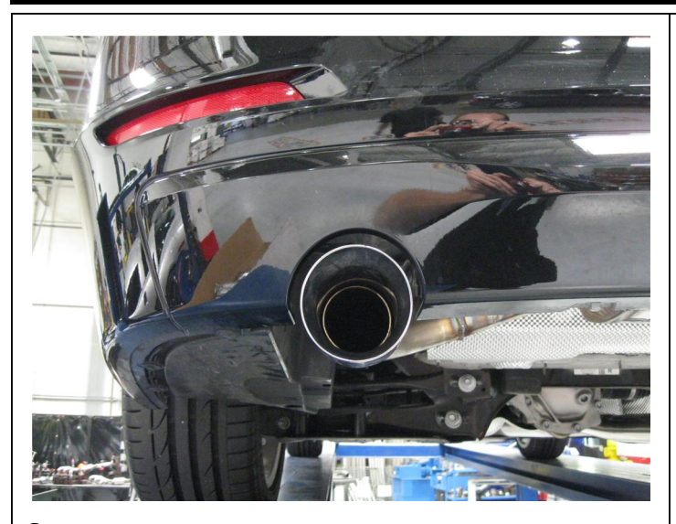
Step 5. Once a final position has been chosen for the new exhaust system, evenly tighten all clamps from front to rear using the torque specifications on page one of the instructions. Inspect all fasteners after 25-50 miles of operation and re-tighten if necessary.