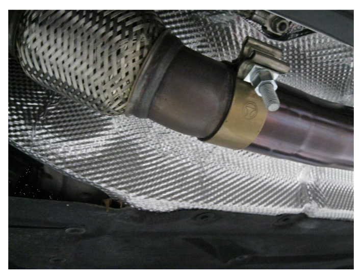
Step 3. Begin installing your new system by first attaching the OEM hanger assemblies you removed to the new system. At this stage you may also replace the underbody cross-mamber. Next, looseley secure the Inlet Pipe Assembly to the OEM flex pipe outlet using the supplied clamp.