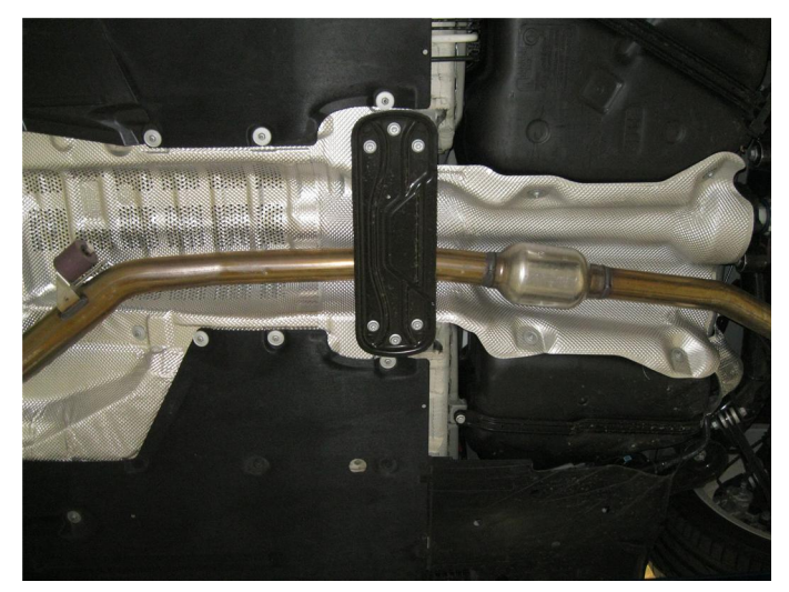
Step 1. Before removing the OEM exhaust system you will need to first remove the underbody cross-member using a #50 male TORX socket.