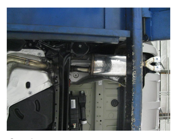
Step 8. Working front to rear install the remaining parts in the same fashion as the Inlet Extension Pipe, fitting hangers into rubber insulators and keeping clamps loose.