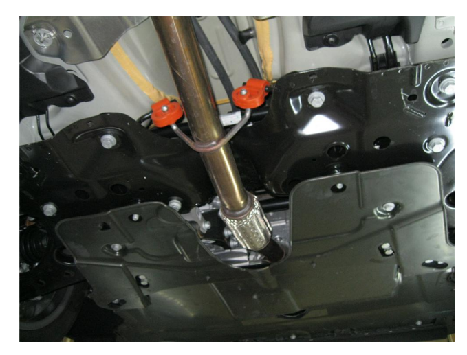
Step 1. Start by removing the engine shield at the front of the vehicle. Underneath this shield is a cross brace that must also be removed.