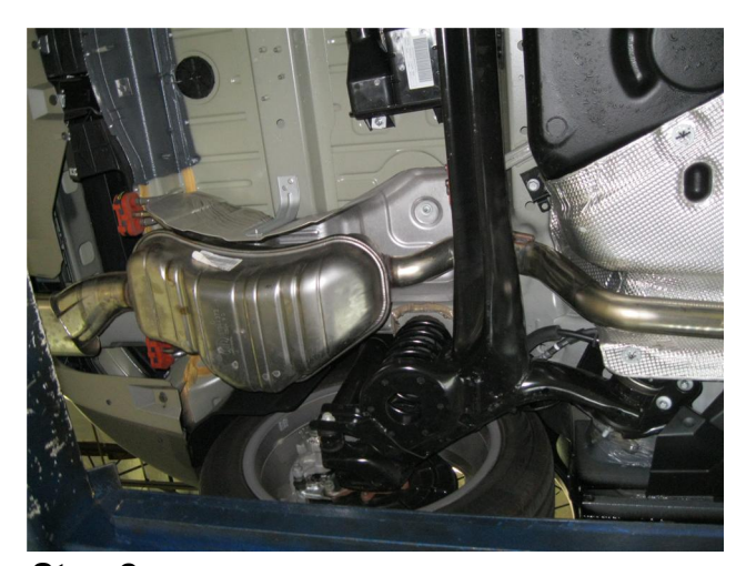
Step 2. Using a Sawzall (or other cutting device) cut the OEM exhaust just in front of the rear muffler. This step is critical as the exhaust cannot be removed without cutting.