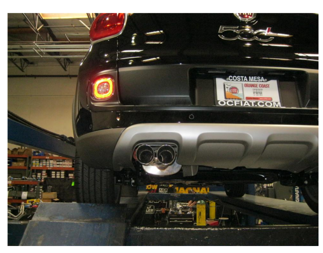
Step 9. Once a final position has been chosen for the new exhaust system, evenly tighten all clamps from front to rear using the torque specifications on page one of the instructions. Finish by re-installing the engine shield. Inspect all fasteners after 25-50 miles of operation and re-tighten if necessary.