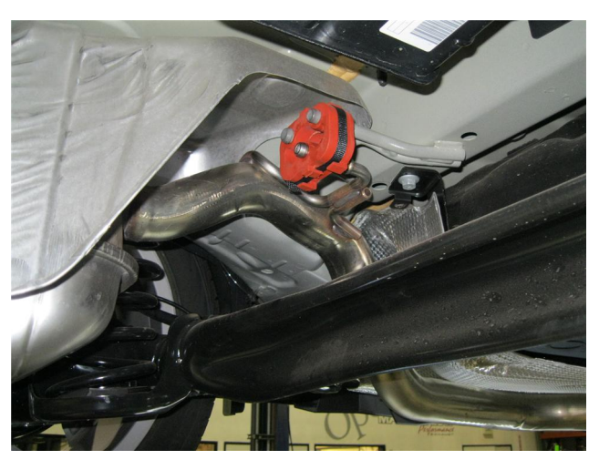
Step 4. Disengage the the exhaust hangers from the rubber insulators (Save the insulators as they will be re-used on the new system)