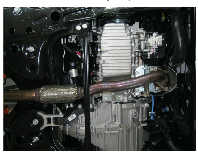
Step 5. Un-fasten the exhaust from the bracket attaching it to the transmission. Un-fasten the nuts attaching the flange at the bottom of the exhaust manifold and remove exhaust.