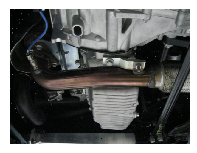
Step 6. Begin installation of your new MAGNAFLOW exhaust system by attaching the Inlet Pipe Assembly using the OEM nuts at the flange and the OEM bolt and supplied M8 nut at the transmission mount. Insert hangers into OEM rubber insulators and re-install the cross brace and o2 sensor.