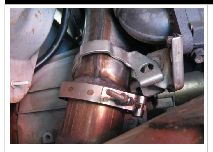
Step 1. Remove the OEM system by first unbolting the the clamp at the outlet of the OEM downpipe and then unbolting the inlet flange of the OEM downpipe from the turbo.