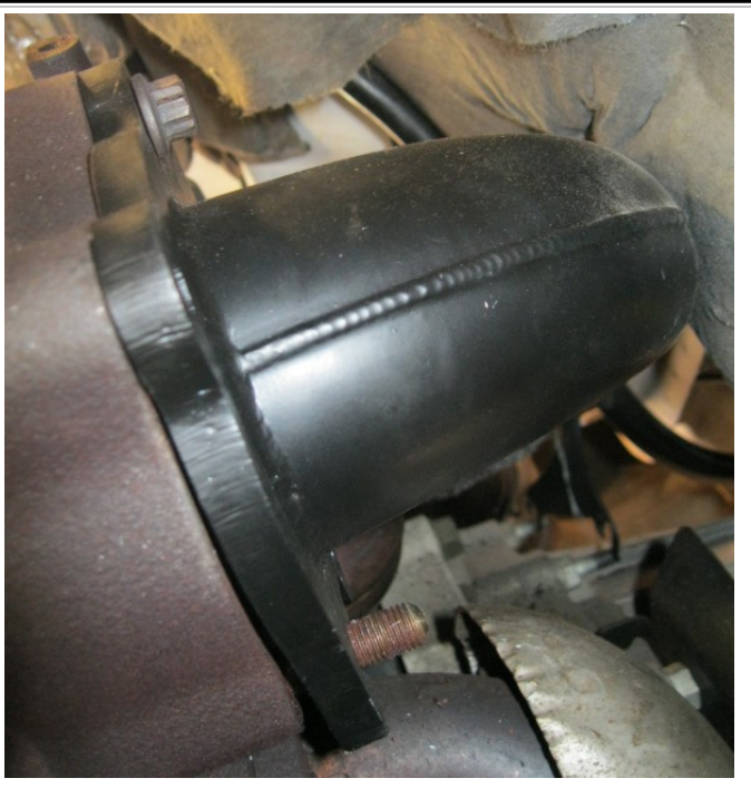
Step 3. Install your new downpipe by first attaching the Inlet flange to the turbo. Using the existing OEM harware hand tighten the new MagnaFlow downpipe to the Turbo. Then install the clamp onto the outlet and connect to the exhaust system