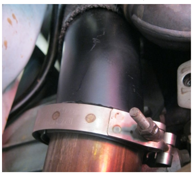
Step 4. Once a final position has been chosen for the new downpipe, evenly tighten all bolts and clamps from front to rear using the torque specifications on page one of the instructions. Inspect all fasteners after 25-50 miles of operation and re-tighten if necessary.

MAGNAFLOW: 1901 Corporate Centre Dr - Oceanside, CA 92056 | 1(800)990-0905 Technical Support: 1(800) 959-9226 | Email: moreinfo@magnaflow.com