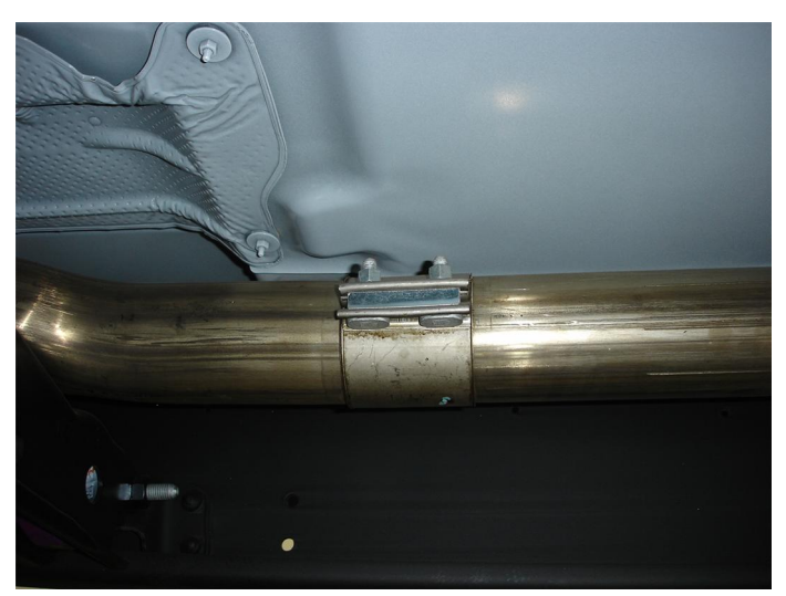
Step 1. To begin the removal of the OEM system you will need to unfasten the inlet. For vehicles '01 - '05 you will need to unbolt the inlet flange. For vehicles '06 - '07 there is a slip clamp that needs to be loosened. You can then disengage the welded hangers from the rubber insulators, working rearward finish removing the system. You may need to cut the OEM system to ease the removal process. Do not damage or discard the OEM fasteners and rubber insulators, as they will be reused to mount the new system.