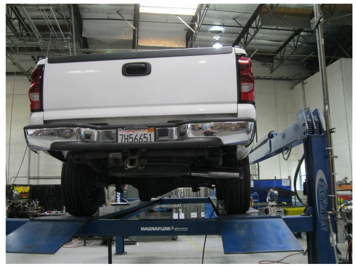
Step 6. Once a final position has been chosen for the new exhaust system, evenly tighten all clamps from front to rear using the torque specifications on page one of the instructions. Inspect all fasteners after 25-50 miles of operation and re-tighten if necessary.