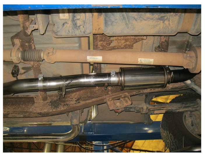
Step 5. Install the Muffler Assembly, Over Axle Pipe and Tail Pipe Assembly in a similar fashion to the Extension Pipe Assembly using the supplied clamps. Engage all welded hangers to the rubber insulators.