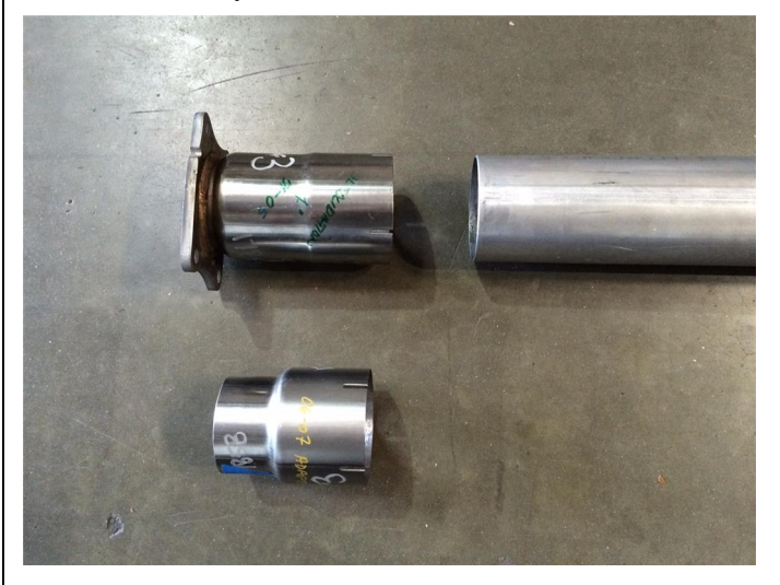
Step 2. Before installing your new system select the correct inlet adapter for your vehicles year. The larger adapter with the flange attached covers '01 - '05, the slip adapter covers '06 - '07. Attach the appropriate adapter by either bolting it to he vehicle outlet using the OEM fasteners or inserting the adapter into the slip clamp and loosely securing.