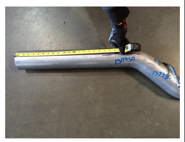
Step 3. The inlet end of the Mid Pipe Assembly may need to be trimmed depending on the year and cab configuration of your vehicle.

'01 - '05 Extended Cab: Cut 9.00" '06 - '07 Extended Cab: Cut 11.00" '06 - '07 Crew Cab: Cut 4.00" '01 - '05 Crew Cab: DO NOT CUT