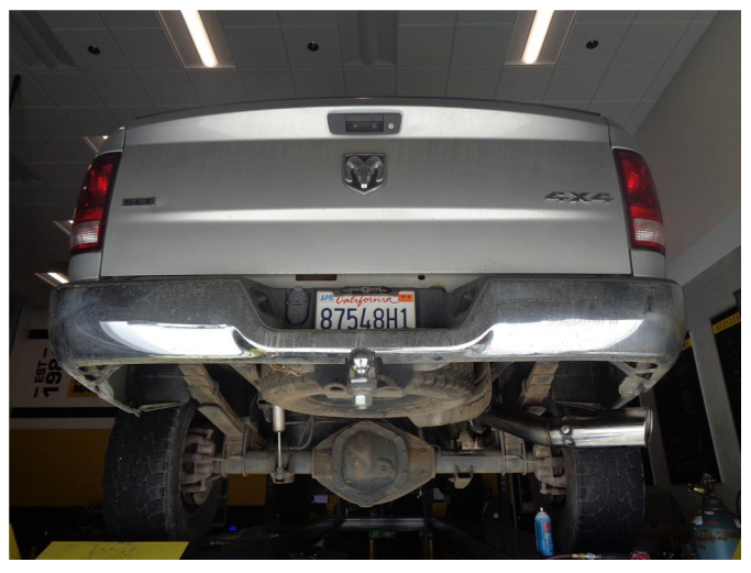
Step 7. Once a final position has been chosen for the new exhaust system, evenly tighten all clamps from front to rear using the torque specifications on page one of the instructions. Inspect all fasteners after 25-50 miles of operation and re-tighten if necessary.