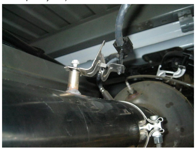
Step 4. For year spread 2013 and later with a long bed configuration attach the OEM cable bracket using the OEM bolt. This step is not required on other years or configurations.

Step 3. Begin installation of the Magnaflow system by clamping the Inlet Pipe or Over Axle Pipe (depending on vehicle configuration) to the outlet of the DPF using a supplied 4.00" clamp. Locate the alignment notch to the OEM outlet. Slide the Hanger Clamp Assembly over the pipe and locate the welded hangers in the rubber insulators (leave all clamps loose for final adjustment of the complete system).