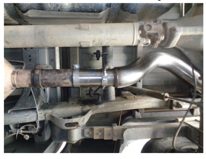
Step 2. Before installing the new system defermine which extension pipe configuration you will require. If you are cutting the Inlet Pipe [Item 2] to size measure from the end without the notches. Be sure to deburr and clean the cut edge.

Step 3. Begin installation of the Magnaflow system by clamping the Inlet Pipe or Over Axle Pipe (depending on vehicle configuration) to the outlet of the DPF using a supplied 4.00" clamp. Locate the alignment notch to the OEM outlet. Slide the Hanger Clamp Assembly over the pipe and locate the welded hangers in the rubber insulators (leave all clamps loose for final adjustment of the complete system).