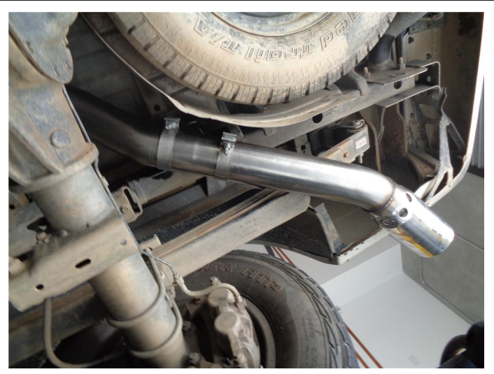
Step 6. Next, loosely slip the Hanger Clamp Assembly over the Tail Pipe Assembly and Install using the supplied clamps and by fitting the welded hangers into the rubber insulators.