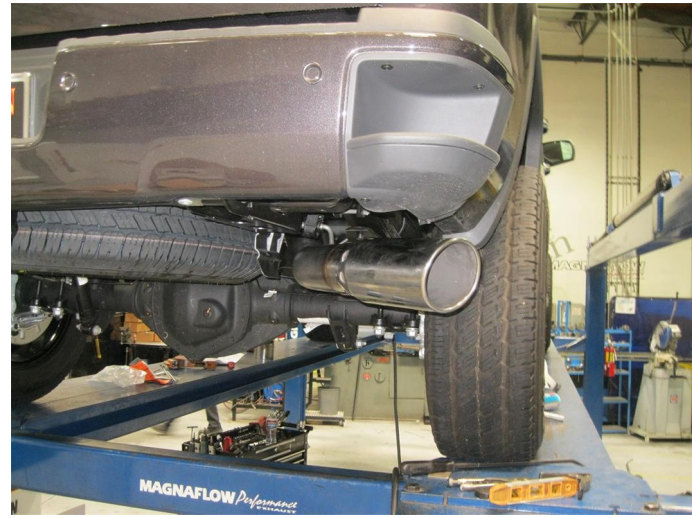
Step 4. Once a final position has been chosen for the new exhaust system, evenly tighten all clamps from front to rear using the torque specifications on page one of the instructions. Inspect all fasteners after 25-50 miles of operation and re-tighten if necessary.