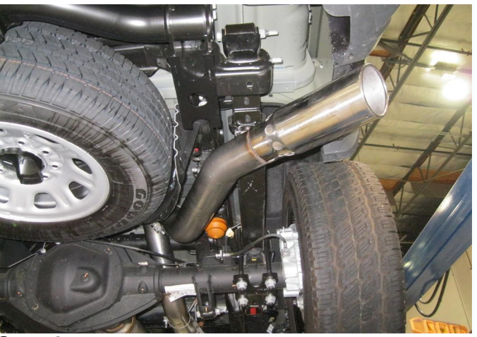
Step 3. Next Install the Tail Pipe Assembly in a similar fashion using the supplied 4.00" clamps and by fitting the welded hangers into the rubber insulators.