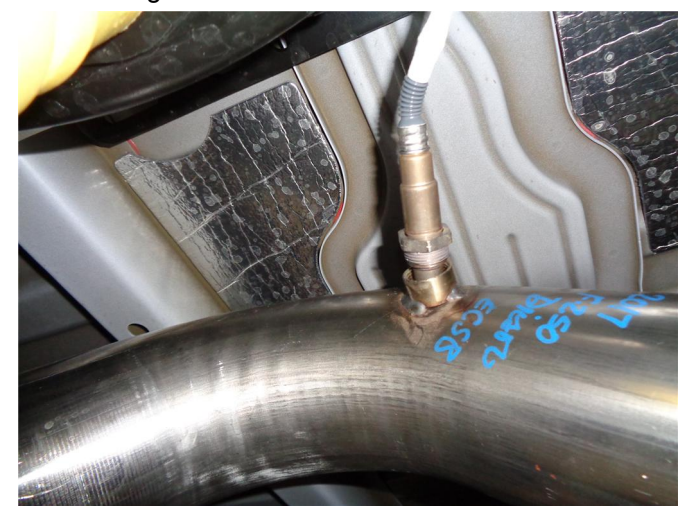
Step 6. Reattach the O2 sensor (6.7L only).