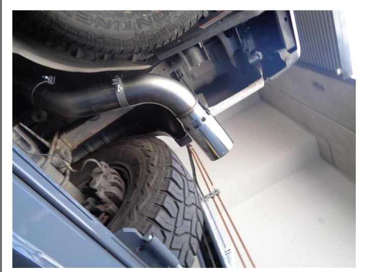
Step 5. Loosely slip the Hanger Clamp Assembly over the Tail Pipe Assembly. Loosely install the Tail Pipe Assembly using the supplied clamp. Engage the welded hanger to the rubber insulator.