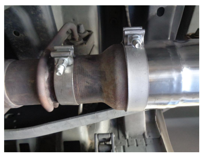
Step 3. Begin installation by loosely attaching the Inlet Pipe Assembly to the OEM flange outlet using the OEM hardware (6.7L), or loosely attach the Inlet Adapter to the DPF outlet using the supplied clamp (6.4L). Loosely attach the Extension Pipe, if needed, using the supplied clamp.

Step 2. Determine the overall length of the Inlet Pipe Assembly and the Extension Pipe, if required using the chart. The measurements are what needs to be cut from the outlet end of the pipes.