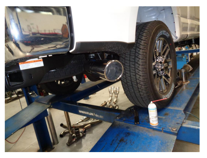
Step 7. Once a final position has been chosen for the new exhaust system, evenly tighten all clamps from front to rear using the torque specifications on page one of the instructions. Inspect all fasteners after 25-50 miles of operation and re-tighten if necessary.