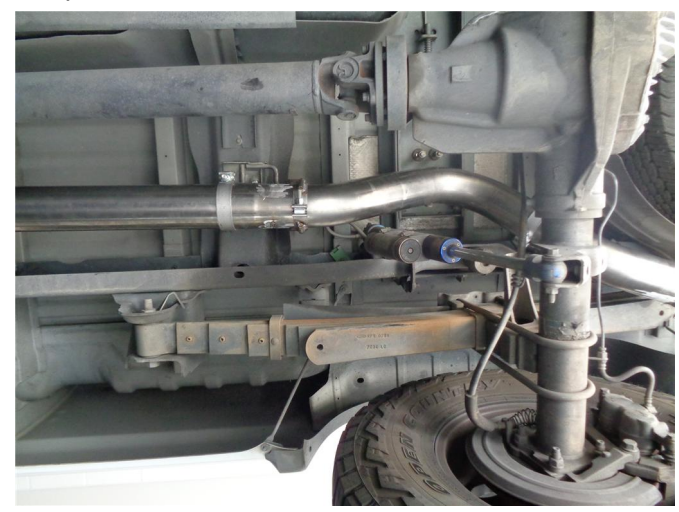
Step 4. Loosely install the Over Axle Pipe Assembly using the supplied clamp. Remove the sensor plug for 6.7L application. Loosely slip the Hanger Clamp Assembly over the pipe and locate the welded hangers to the rubber insulators.