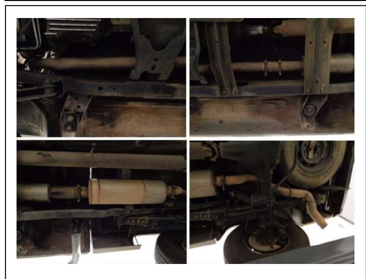
Step 1. Working front to rear loosen or remove all OEM band clamps and disengage all welded hangers from the rubber insulators. Be sure to retain all mounting hardware as it will be needed to install your new MAGNAFLOW system.