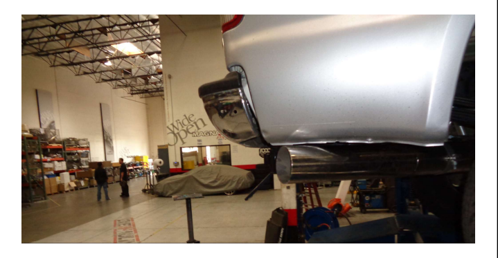
Step 6. Once a final position has been chosen for the new exhaust system, evenly tighten all clamps from front to rear using the torque specifications on page one of the instructions. Inspect all fasteners after 25-50 miles of operation and re-tighten if necessary.