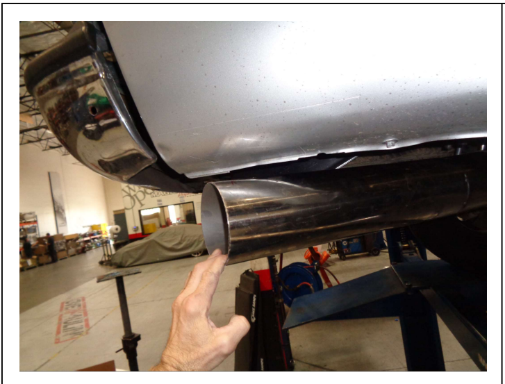
Step 5. Install the Tail Pipe Assembly in the same way. The Outlet may be trimmed as desired.