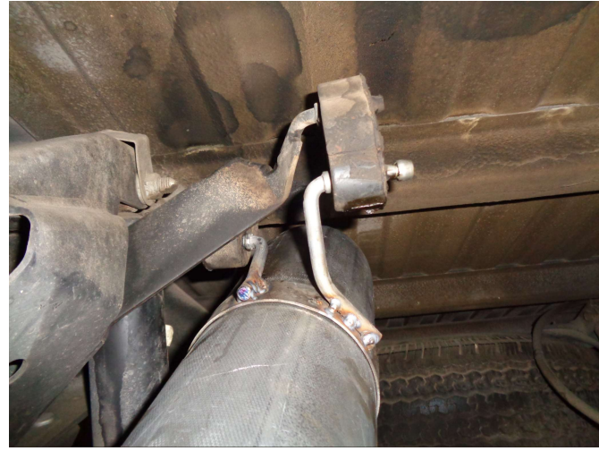
Step 4. Loosely install the Over Axle Pipe Assembly using the supplied clamps. Locate both hangers to the rubber insulators.