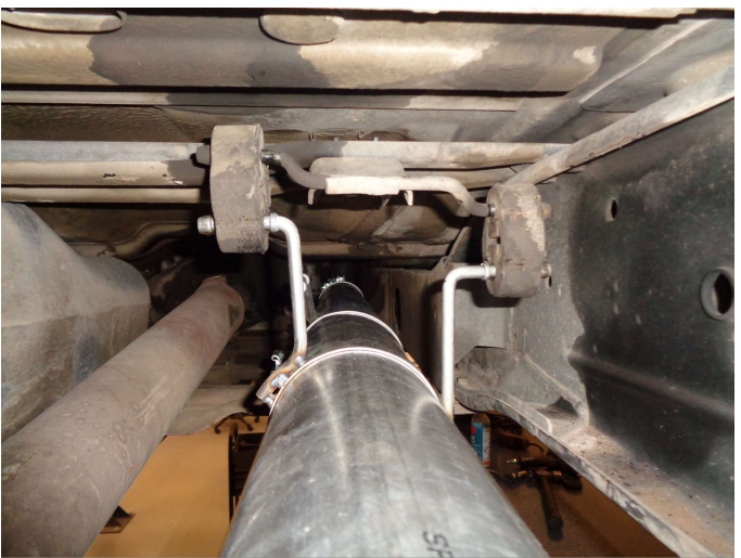
Step 3. As you assembly the Extension Pipes loosely locate the Hanger Clamp Assemblies as needed.