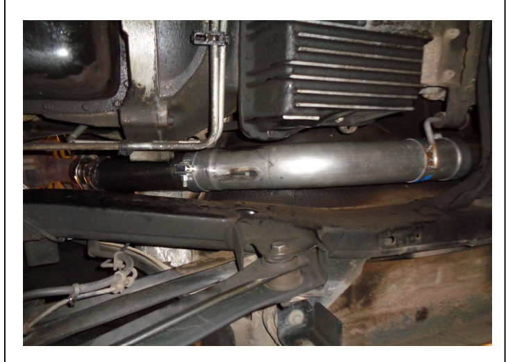
Step 2. Install the corresponding Inlet Pipe Assembly and loosely fasten it to the turbo charger outlet using the OEM clamp. Next, loosely attach the Inlet Pipe Lower Assembly to the Inlet Pipe Assembly using the supplied clamp. Refer to the table below to select the appropriate extension pipes for your vehicles configuration.