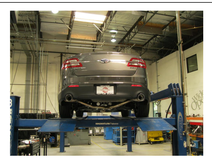
Step 4. Once a final position has been chosen for the new exhaust system, evenly tighten all clamps from front to rear using the torque specifications on page one of the instructions. Inspect all fasteners after 25-50 miles of operation and re-tighten if necessary.