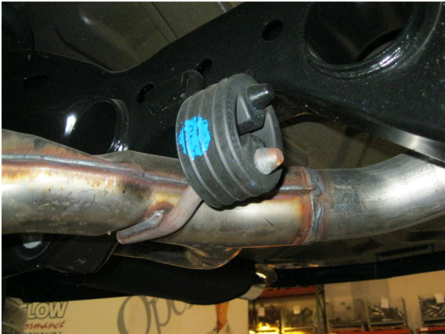
Step 1. To remove the OEM exhaust loosen the clamp located in front of the factory resonator. Next disengage all welded hangers from the rubber insulators (Do not damage or discard the rubber insulators as they will be re-used to mount the new system) and remove the exhaust from the vehicle.