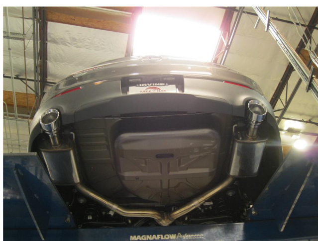
Step 3. Next attach the Y-Pipe Assembly to the Resonator Assembly and then the Muffler Assemblies to the Y-Pipe using the supplied 2.50" clamps. Insert hangers into rubber insulators.