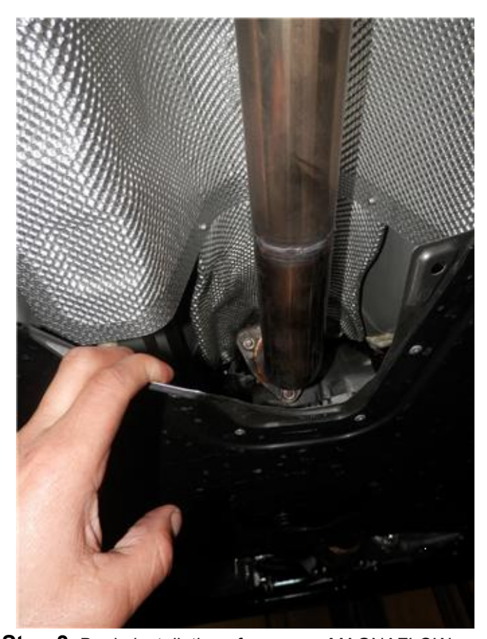
Step 3. Begin installation of your new MAGNAFLOW system by attaching the Inlet flange of the Inlet Resonator Assembly to the catalytic converter outlet using the OEM fasteners. Engage the welded hanger to the rubber isolator. Keep all fasteners and clamps loose until final adjustment.