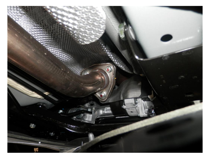
Step 1. Begin removal of the OEM exhaust system by unbolting the inlet flange attaching the exhaust to the catalytic converter. Do not discard or damage the OEM fasteners or rubber insulators as they will be used to install the new system.