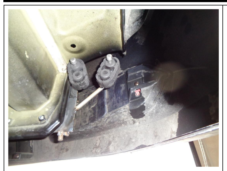
Step 5. Using the supplied hardware and rubber hangers, bolt the new bracket to the driver side.