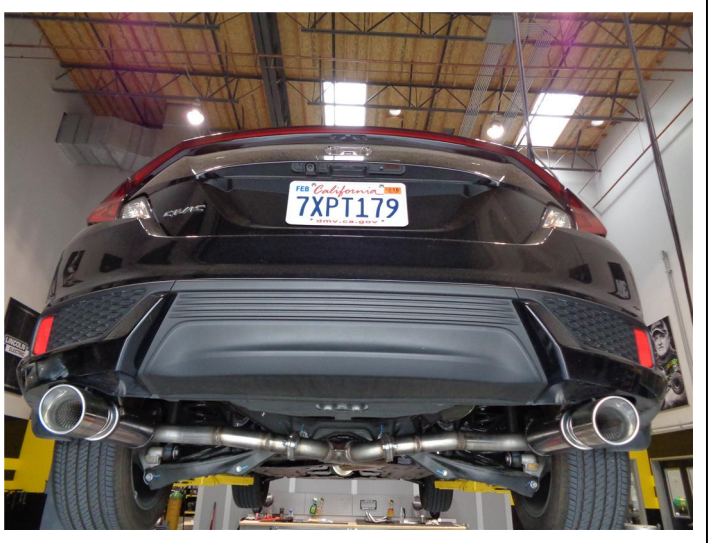
Step 7. Once a final position has been chosen for the new exhaust system, evenly tighten all clamps from front to rear using the torque specifications on page one of the instructions. Inspect all fasteners after 25-50 miles of operation and re-tighten if necessary.