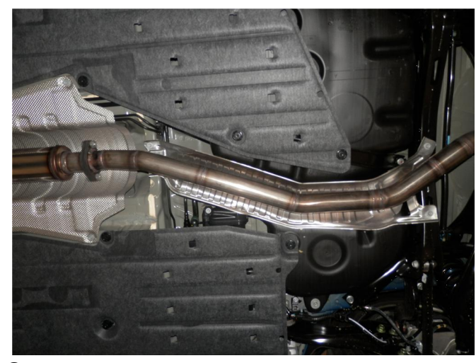
Step 4. Next attach the Y-Pipe Assembly to the Inlet Resonator Assembly by coupling the flanges using the supplied gasket and hardware.