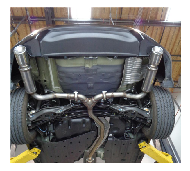
Step 6. Loosely attach both driver and passenger side Muffler Assembly flanges to the Y-Pipe Assembly. Secure with the supplied gaskets and hardware. Engage welded hangers to rubber isolators.