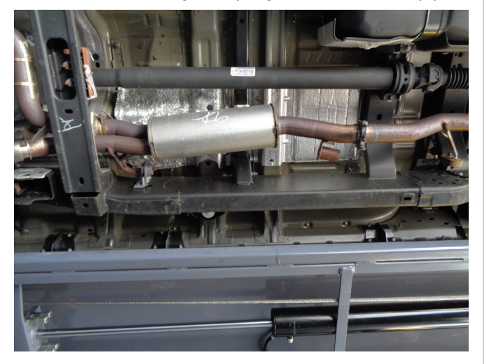
Step 2: Next loosen the clamp rearward of the OEM resonator. Detach all welded hangers from the rubber insulators. The system may now be removed. Be sure to retain all mounting hardware as it will be needed to install your new MAGNAFLOW system