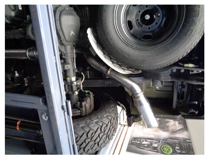
Step 6: Finish by loosely installing the Tail Pipe Assembly using the supplied clamp. Install the welded hanger to the rubber insulator.