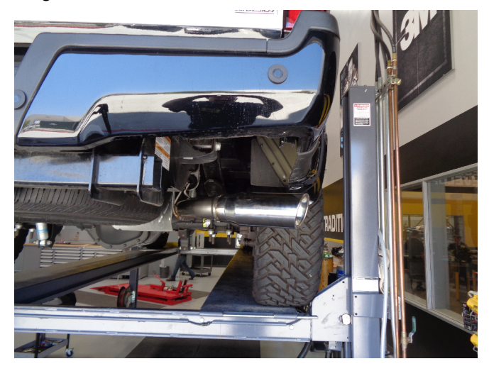
Step 7: Once a final position has been chosen for the new exhaust system, evenly tihgten all clamps from front to rear using the torque specifications on page one of these instructions. Inspect all fasteners after 25-50 miles for operation and re-tighten if necessary.

MAGNAFLOW: 1901 Corporate Centre Dr - Oceanside, CA 92056 | 1(800)990-0905 Technical Support: 1(800) 959-9226 | Email: moreinfo@magnaflow.com