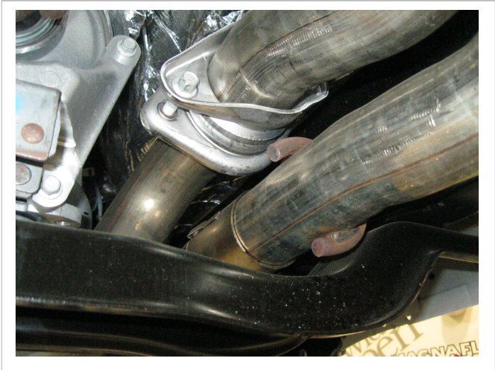
Step 1: To remove the OEM system loosen the clamp at the inlet pipe junction to the catalytic converters. Next, unbolt the flange coupling at the other inlet pipe.