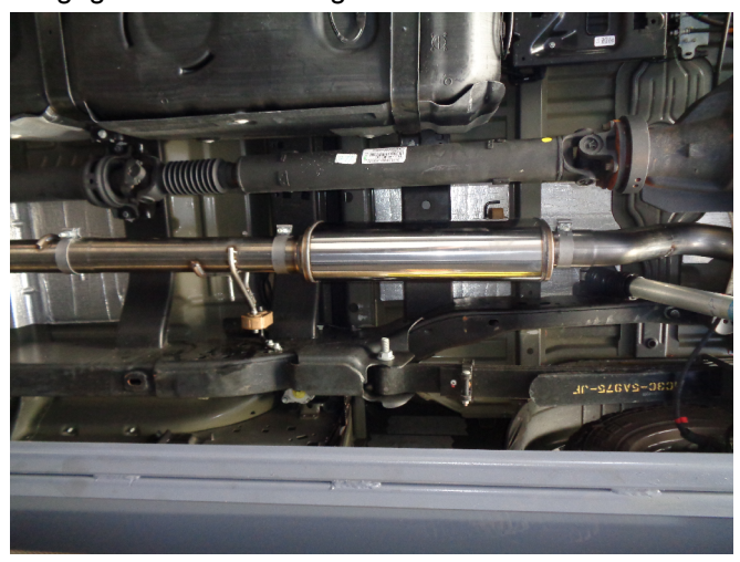
Step 5: If required add the 19.25" Extension Pipe. Loosely attach the Extension Pipe Assembly using the supplied clamp[s]. Engage the welded hanger to the rubber insulator.

MAGNAFLOW: 1901 Corporate Centre Dr - Oceanside, CA 92056 | 1(800)990-0905 Technical Support: 1(800) 959-9226 | Email: moreinfo@magnaflow.com