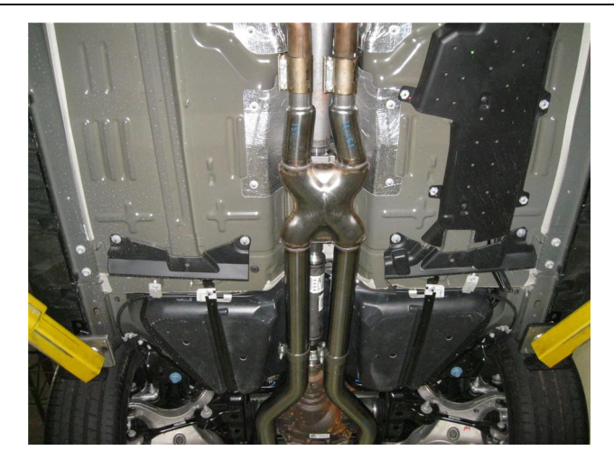
Step 3. Begin installation of the new system by loosely attaching the X-Pipe Assembly to the outlets using the OEM clamps. Leave all clamps loose until final adjustment.