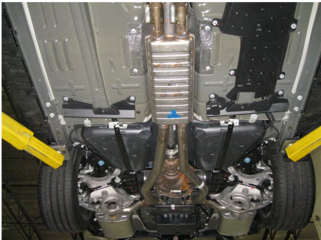
Step 2. Begin removing the OEM exhaust system by loosening the clamps located in front of the resonator. Next working front to rear extract the hangers from the rubber insulators and remove the OEM system. Retain insulators and clamps as they will be used to install the new system.