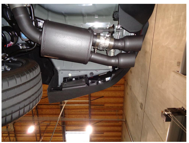
Step 5. Finish the initial installation by fitting the Muffler Assemblies onto the Mid pipe Assemblies using the supplied 3.00" clamps and inserting the hangers into the rubber insulators.