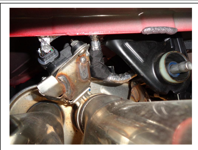
Step 1. To begin, determine if your vehicle has OE exhaust valves, if so, you will need to unplug and the electrical connection on the Exhaust Valve Control Motors (Qty 2)located on the OEM exhaust assembly, also disconnect wire harness mounting plug.