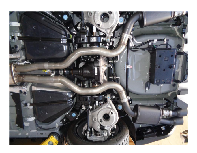
Step 4. Next attach the Mid Pipe Assemblies to the X-Pipe using the supplied 3.00" clamps and fitting the hangers into the rubber insulators.