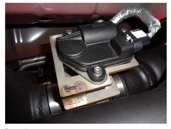
Step 6 . If your vehicle has valves, re-connect the wiring harness plugs to the Valve motors and wire mounting bracket. If not yet purchased, Valve Kit is part# 10805