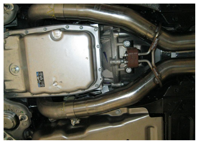
Step 4. On vehicles with automatic transmission you will need to disconnect the shift linkage located on the drivers side of the transmission.

Step 3. Next, remove the six 10mm bolts from the valence top. Carefully release the tabs on the top of the valence. The valence may now be removed.