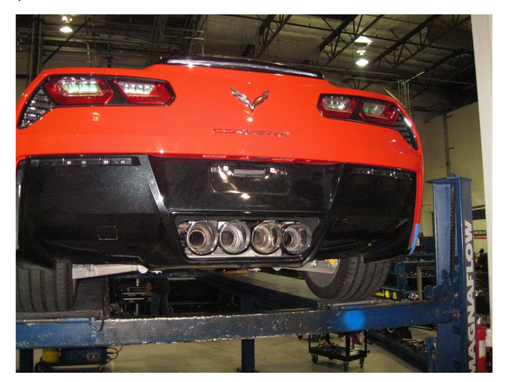
Step 9. Once a final position has been chosen for the new exhaust system, evenly tighten all clamps from front to rear using the torque specifications on page one of the instructions. Inspect all fasteners after 25-50 miles of operation and re-tighten if necessary.

Step 8. Locate both OEM hanger brackets to each Tail Pipe Assembly. Next, loosely attach both assemblies to the Inlet Pipe Assembly outlets using the supplied 3.00" clamps. Using the supplied nuts, bolts and washers connect the two hanger brackets that will link both sides together. Reconnect each wiring harness connector the the valve motors. Reinstall the rear valence in the reverse order of the removal process.