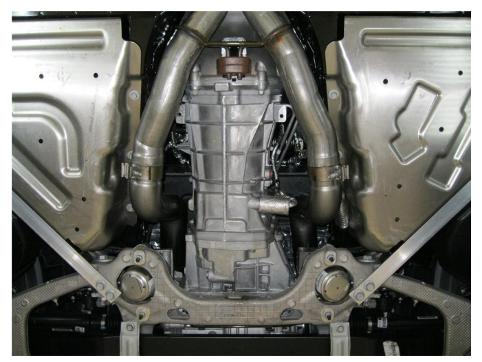
Step 7. Begin installation of you new MAGNAFLOW exhaust system by attaching each valve motor to the new system using the OEM fasteners. Install both drivers side and passengers side Inlet Pipe Assemblies to the OEM X-Pipe. Loosely secure using the OEM clamps.

Step 6. Loosen both OEM clamps just rearward of the stock X-Pipe assembly. The OEM exhaust system may now be removed.