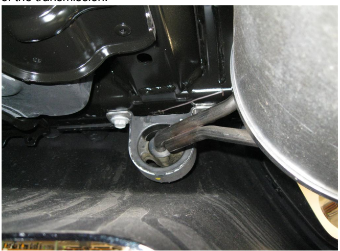
Step 5. Unbolt both hanger brackets located either side of the muffler assemblies. Unclip the plug connecting the valve motor assemblies to the inlet pipes. Disconnect the wiring harness on both sides of the tail pipe assemblies.