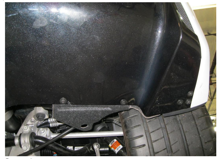
Step 2. Then you will need to remove the five 7mm bolts on both sides of the valance underside. Remove two 10mm bolts above the exhaust tips. The valence is fastened from the backside with molded-in plastic tabs. Release the six tabs from the valence by gently pulling each tab from the valence.

Step 1. To remove the OEM exhaust system you will first need to remove the rear valance. To do so you will need to remove The two 10mm bolts behind each reflector, the two 10mm bolts behind the license plate and two more 10mm bolts just underneath the license plate.