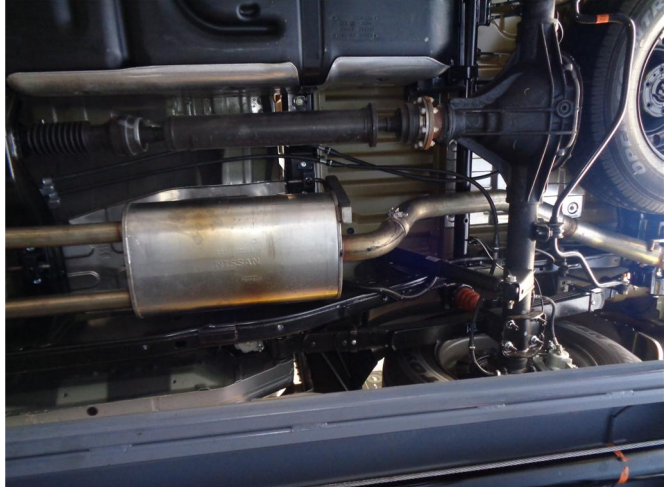
Step 1. To remove the OEM exhaust loosen the fasteners at the 2 bolt flange attaching the inlet pipe to the catalytic converter outlet. Working front to rear disengage all welded hangers from the rubber insulators. Also, loosen the clamp after the muffler. Be sure to retain all mounting hardware as it will be needed to install your new MAGNAFLOW system.