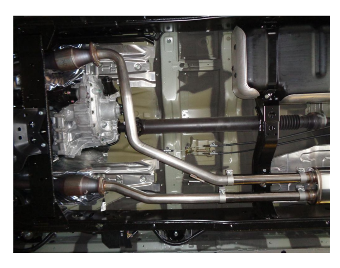
Step 2. Begin installation by loosely attaching the Inlet Pipe Assembly to the catalytic converter flange using the OEM hardware. Engage the welded hanger to the rubber insulator.