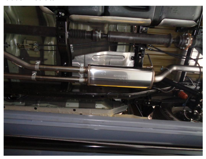
Step 3. Loosely attach the Muffler Assembly using the supplied clamps. Engage all welded hangers to the rubber insulators.