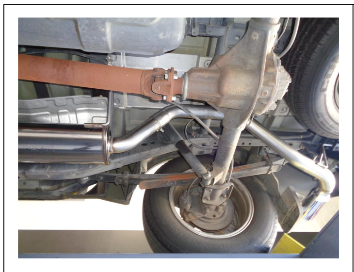
Step 4. Next loosely attach the Tail Pipe Assembly to the Muffler Assembly using the supplied clamp. Engage the welded hanger to the rubber insulator.