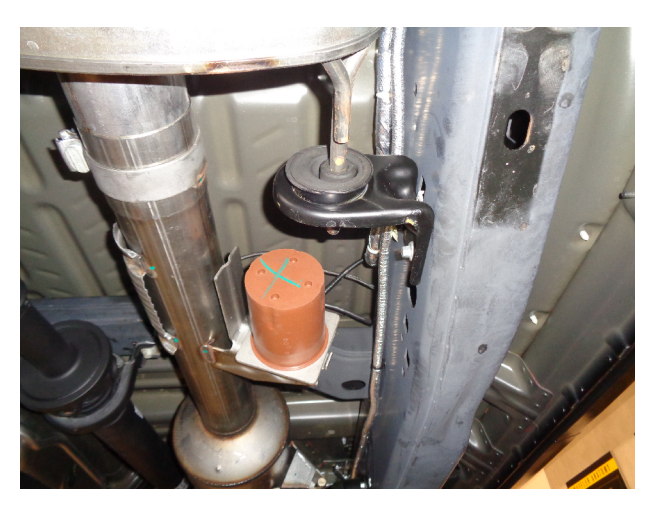
Step 1. Working front to rear loosen or remove all OEM band clamps and disengage all welded hangers from the rubber insulators. Be sure to retain all mounting hardware as it will be needed to install your new MAGNAFLOW system. Slide the OEM system off towards the front of the vehicle.