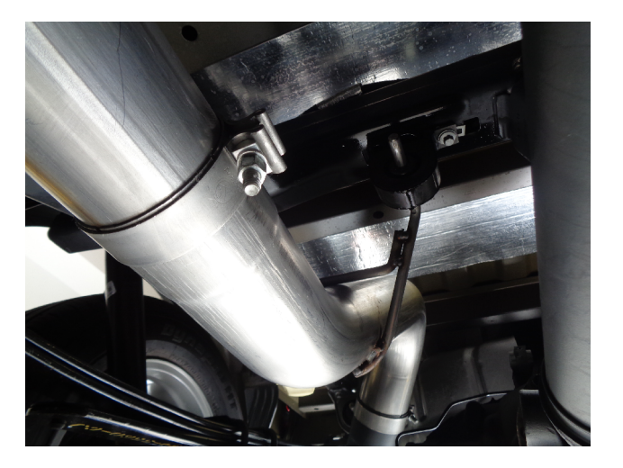
Step 3. As you assemble the Extension Pipes loosely locate the Hanger Clamp Assemblies as needed then instal the over axle pipe.