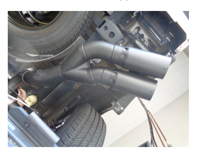
Step 4. Install the Tail Pipe Assembly in the same way. Once a final position has been chosen for the new exhaust system, evenly tighten all clamps from front to rear using the torque specifications on page one of the instructions. Inspect all fasteners after 25-50 miles of operation and re-tighten if necessary.

MAGNAFLOW: 1901 Corporate Centre Dr - Oceanside, CA 92056 | 1(800)990-0905 Technical Support: 1(800) 959-9226 | Email: moreinfo@magnaflow.com