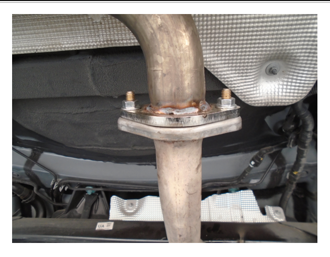
Step 2: Begin Installing the new MagnaFlow system by attaching the inlet pipe to the OE outlet using the supplied fasteners and gasket.