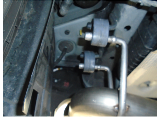
Step 3: Next, insert the hangers into the rubber insulators.

MAGNAFLOW: 1901 Corporate Centre Dr - Oceanside, CA 92056 | 1(800)990-0905 Technical Support: 1(800) 959-9226 | Email: moreinfo@magnaflow.com