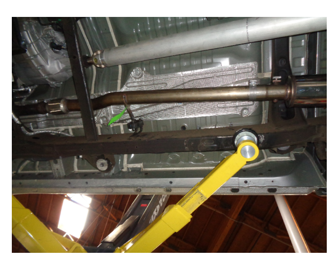
Step 3. Install the appropriate extension pipe depending on the cab size. Install the Inlet Pipe using the supplied 3.00" clamp then attach the Muffler Assembly to the Extension Pipe.