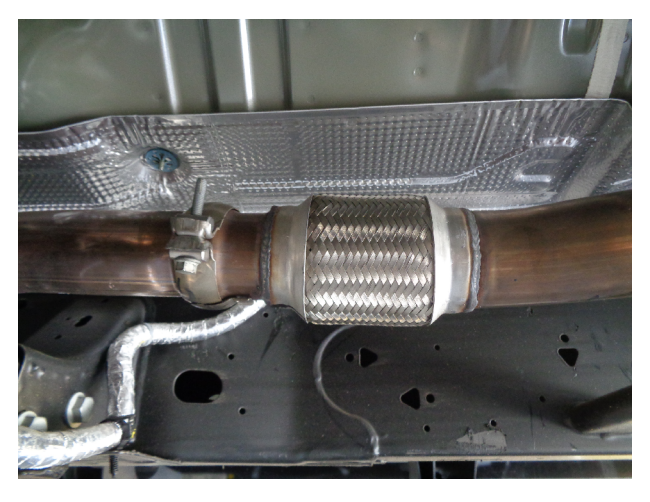
Step 2. To begin, fasten the Inlet pipe assembly to the outlet of the OE system using the OE clamp assembly and by fitting the welded hanger into the rubber insulator (Leave all clamps and fasteners loose for final adjustment of the complete system.)