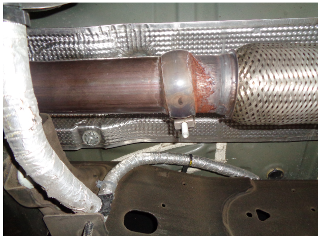
Step 1. To remove the OEM exhaust system, you will to need to cut the between the muffler and the Y junction where it goes over the axle. You can then disengage the welded hangers from the rubber insulators and remove the tailpipe assy. Unfasten the clamp attaching the OEM inlet pipe assembly to the catalytic converter. Do not damage or discard the inlet pipe clamp or rubber insulators as they will be re-used to mount the new system. Disengage the inlet pipe assembly hanger and remove the exhaust from the vehicle.