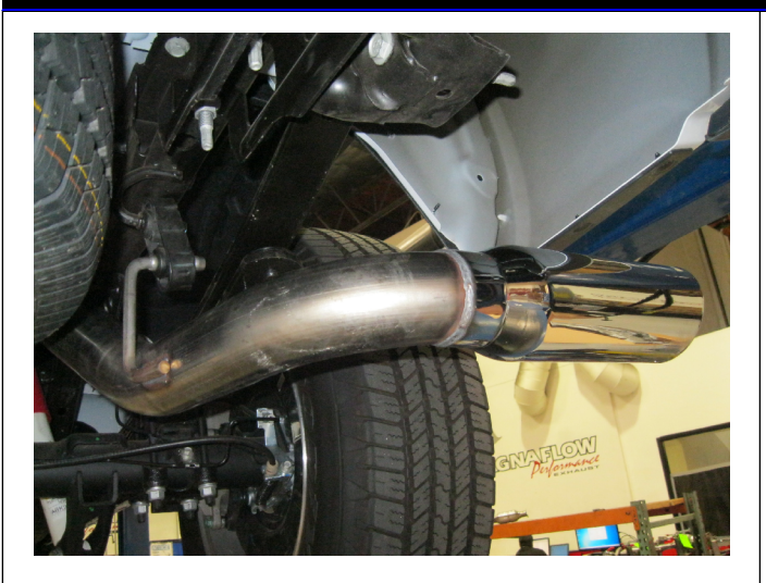
Step 4. Next loosely attach the Tailpipe Assembly to the Muffler Assembly using the supplied clamp. Engage the welded hanger to the rubber insulator.