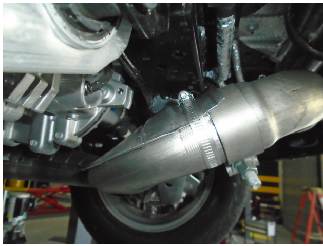
Step 2 : Begin installing the new exhaust system by attaching the specific Inlet Pipe (2.0L or 1.5L engine) to the cut OE outlet using the supplied 2.18/2.36 clamp. Use the supplied hose clamp to re-attach the heatshield if necessary.

MAGNAFLOW: 1901 Corporate Centre Dr - Oceanside, CA 92056 | 1(800)990-0905 Technical Support: 1(800) 959-9226 | Email: moreinfo@magnaflow.com