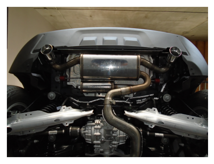
Step 3 Next, attach the Muffler Assembly to the Inlet Pipe using the supplied 2.25" clamp. Engage the welded hangers to the rubber insulators. It may be necessary to loosen the pipe junction between the catalytic converter and the OE resonator to allow for proper tip alignment.