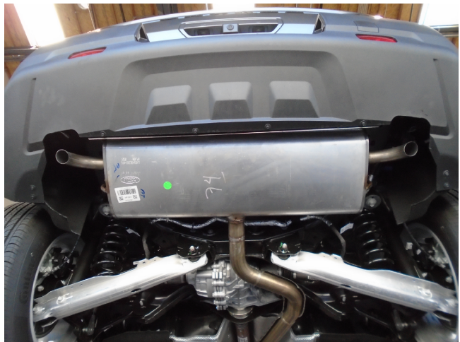
Step 1 : To remove the OEM system you will need to cut the pipe leading into the muffler assembly. Measure 3.00" back from the weld junction at the front of the muffler (See images). On 2.0L vehicles you will need to cut the clamp and move the heat shield. out of the way temporarily. Once the pipe is cut, With the Muffler supported, extract the hangers from the rubber insulators and remove the Muffler Assembly. Clean and de-burr pipe end. Do not damage or discard the rubber insulators as they will be used in the new system installation.