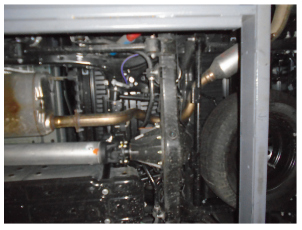
Remove the OE Muffler by loosening and removing the bolts at the outlet flange. Then disengage the hangers from the rubber insulators. Do not damage the rubber insulators or discard the fasteners as these will be used for the new MagnaFlow Muffler.