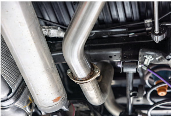
Step 3: Install new MagnaFlow Muffler by first sliding the outlet onto the OE System and then bolting the MagnaFlow flange to the OE flange using the OE fasteners.