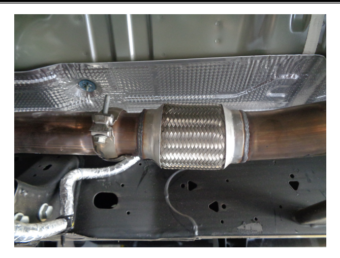
Step 2. To begin, fasten the Inlet pipe assembly to the outlet of the OE system using the OE clamp assembly and by fitting the welded hanger into the rubber insulator (Leave all clamps and fasteners loose for final adjustment of the complete system.)

Step 1. To remove the OEM exhaust system, you will to need to cut the between the muffler and the Y junction where it goes over the axle. You can then disengage the welded hangers from the rubber insulators and remove the tailpipe assy. Unfasten the clamp attaching the OEM inlet pipe assembly to the catalytic converter. Do not damage or discard the inlet pipe clamp or rubber insulators as they will be re-used to mount the new system. Disengage the inlet pipe assembly hanger and remove the exhaust from the vehicle.