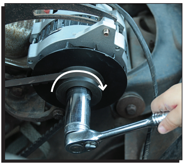
Figure 3 Checking Belt Tension.