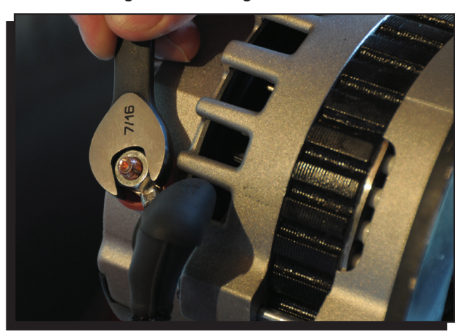
Figure 4 Installing the Charge Wire.