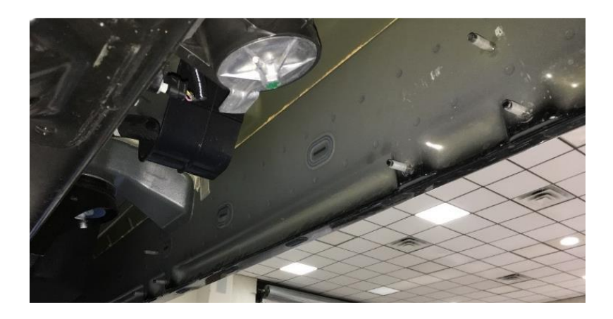
Step 3: On the inside rocker panel there will be three-attachment point consisting of three 8mm studs coming out from the panel. These studs may be covered in paint and will need to be cleaned before the installation.