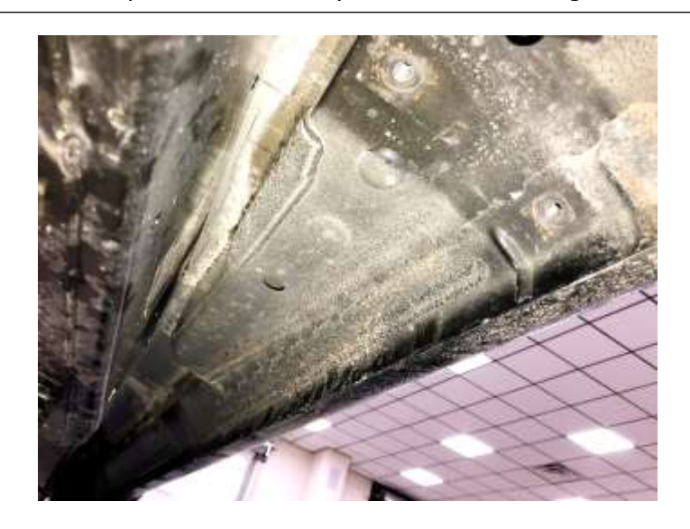
STEP 4: Carefully place step into place and loosely fasten using the supplied M10X25mm hardware.

STEP 2: Remove any factory running boards or hardware and discard. STEP 3: Clean/tap the three factory threaded mounting locations.