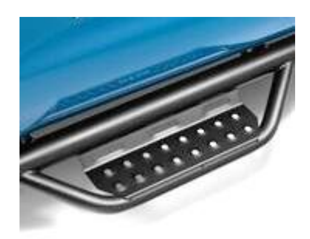
Step 1: Locate the driver side step rail.