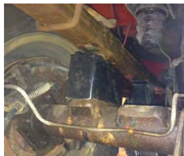
1.5"(2.25") REAR LIFT OPTION