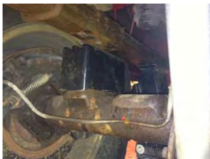
1.0"(1.75") REAR LIFT OPTION

Step 8: Determine whether you want a 1.0", 1.5" or 2.0" rear lift ( 2007-Up Models 1.75", 2.25" or 2.75" ), and orient the components according to the images shown below to achieve your desired right height. IMPORTANT! Be sure that the SHORTER end of the large tapered interlocking block is positioned FORWARD , toward the FRONT of the vehicle.