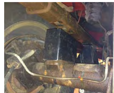
2.0"(2.75") REAR LIFT OPTION

IMPORTANT! THIS IS A PATENT PENDING, INTERLOCKING SYSTEM AND SHOULD NEVER BE STACKED OR USED WITH ANY OTHER LEAF SPRING BLOCKS AS IT MAY CAUSE AN UNSAFE CONDITION FOR BOTH THE INSTALLER & THE VEHICLE DRIVER.