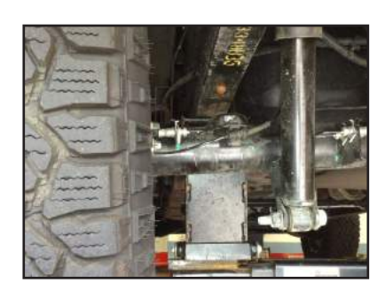
amount of lift. Make sure alignment pins line up with spring and axle perch while raising axle. Make sure FRONT marking on block is facing FRONT of vehicle. 2" interlocking block assembly shown here.