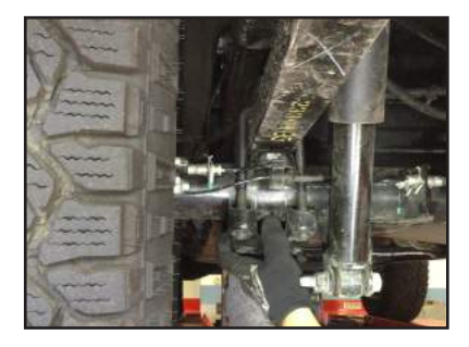
STEP 6: Remove OE U-bolts, and the lower shock fasteners, if required.