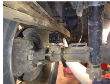
2.0" REAR LIFT OPTION